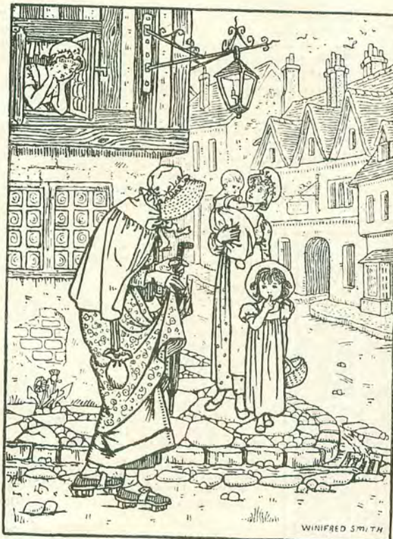
TAKING THE AIR.

"Farine Meal," 653 Feet, Concerning the, 256 Fillet aux Oeufs, 75 Fish Diet, 640 Fish Mould, 75 Fish-Pie, Whole Flake, 101 Fits, Hysterical and Epileptic, 16 Five o'clock in the Morning, 163 Flowers, Called after, 3 Flowers, Painting Wild, in the Fields, 712 Flowers, Paper Baskets for carrying, 215 Flushing after Meals, 31 Forgiveness, 39 Four Quotations, 55 Fowl, Pillau of, 75 Frame, A Painted and Embroidered Photo- graph, 462 Frances Burney, 223 Frauds in Cookery, 253 Free-Wheel Cycles, 59 French Pastry and Cakes, 461 Friendship, 119