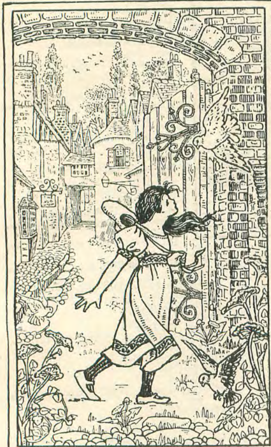
She went forward to meet the New Volume of her favourite Magazine.

Ober-Ammergau, The Passion Play at, 641 Occupation, Change of, 592 Odd Girl Out, The, 9, 24, 37, 49 Odd Numbers, Luck in, 228 Odds and Ends, 650, 765 Old Lines, 809 Old Magazines, What to do with, 110 Olives, Farced, 155