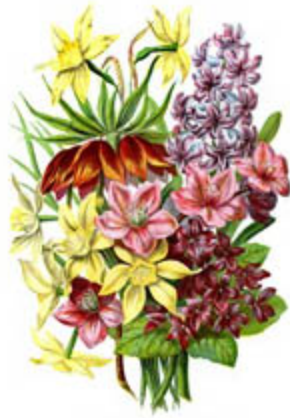
MARCH AND APRIL