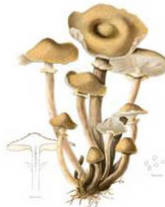
AMANTIA (AMANTIA) MUSCARIANA (L.) MILLER U.S.D. & Forest Service of Dept. of Agr. & Commerce U.S. Bureau of Plant Industry Printed at Washington, D.C.