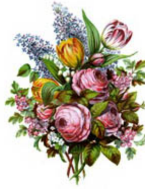
MAY AND JUNE