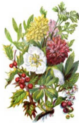
NOVEMBER AND DECEMBER