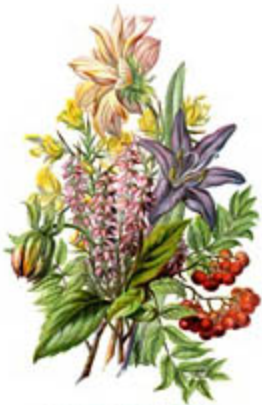
SEPTEMBER AND OCTOBER