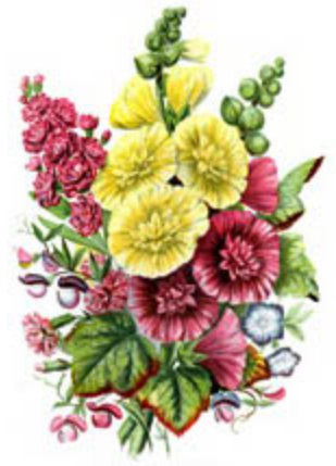
JULY AND AUGUST