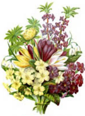
JANUARY AND FEBRUARY