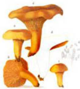
CANTHARELLUS CIBARIUS Fr. U.S.D. & Forest Service of Dept. of Agr. & Commerce U.S. Bureau of Plant Industry Printed at Washington, D.C.