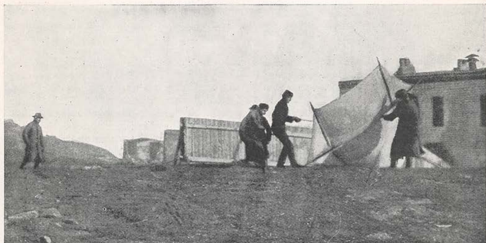
PREPARING TO FLY THE KITE WHICH SUPPORTS THE RECEIVING WIRE. MARCONI ON THE EXTREME LEFT.

A sort of impression prevails that wireless telegraphy is still largely in the uncertain experimental stage; but, as a matter of fact, it has long since passed from the laboratory to a wide commercial use. Its development since Mr. Marconi's first paper was read, in 1896, and especially since the first message was sent from England to France across the Channel, in March, 1899, has been