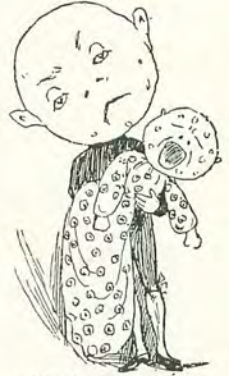
“It's the almonds, sir, please.”

“I give that child up as a bad job,” cried Mr. Plumpudding; “he will be the death of