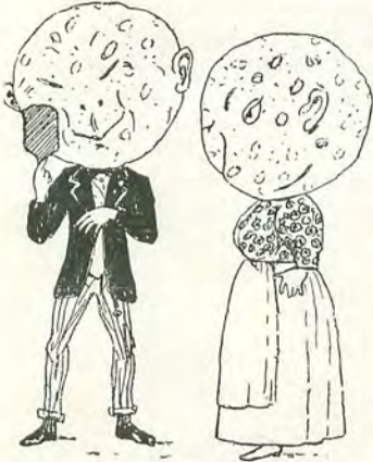
“Surveying himself in a diminutive hand-glass.”

“My love,” said the other, holding his plum-pudding head high in the air, “I should like to behold the hand daring enough to pluck so much as a currant from off my brow. Where's the boy?” he asked, brushing away at a roguish little hat. “Oh, you're there, are you!”