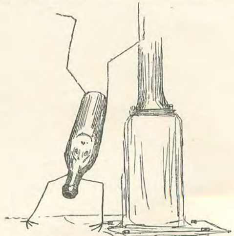
"My legs are deshidedly intoxicated."

"What a degrading exhibition!" said Mr. Plumpudding, turning away in disgust, and motioning to the small boy to follow; but the page could not resist waiting a minute to screw his face into a hideous grimace and stare at the recumbent form of the bottle of port, at the same time emitting