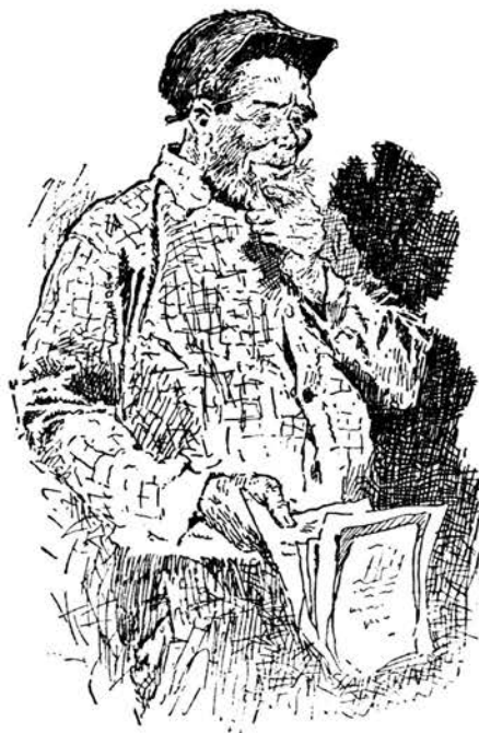
“PROCEED TO COLLECT,” HE SAID, SOFTLY.”

He then wrote Flannery a letter calling his attention to the fact that the pigs were not the property of the company, but were