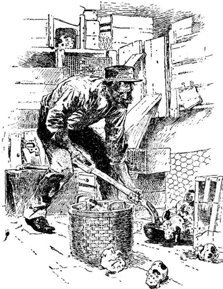
"HE WAS WINDING UP THE GUINEA-PIG EPISODE."

"Well, annyhow," he said, cheerfully, "'tis not so bad as ut might be. What if thim dago pigs had been elephants!"