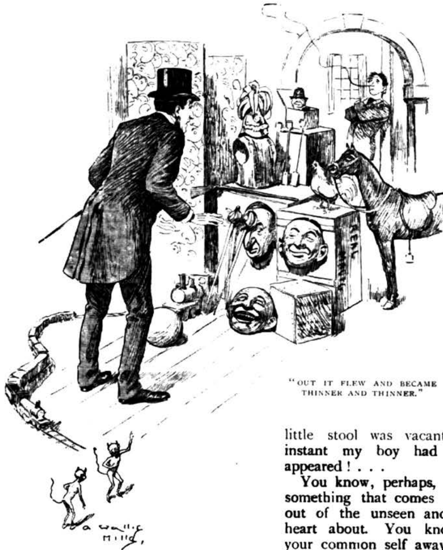
"OUT IT FLEW AND BECAME THINNER AND THINNER."

The shopman with the unequal ears did so without a word, and held the big cylinder towards me to show its emptiness. And the