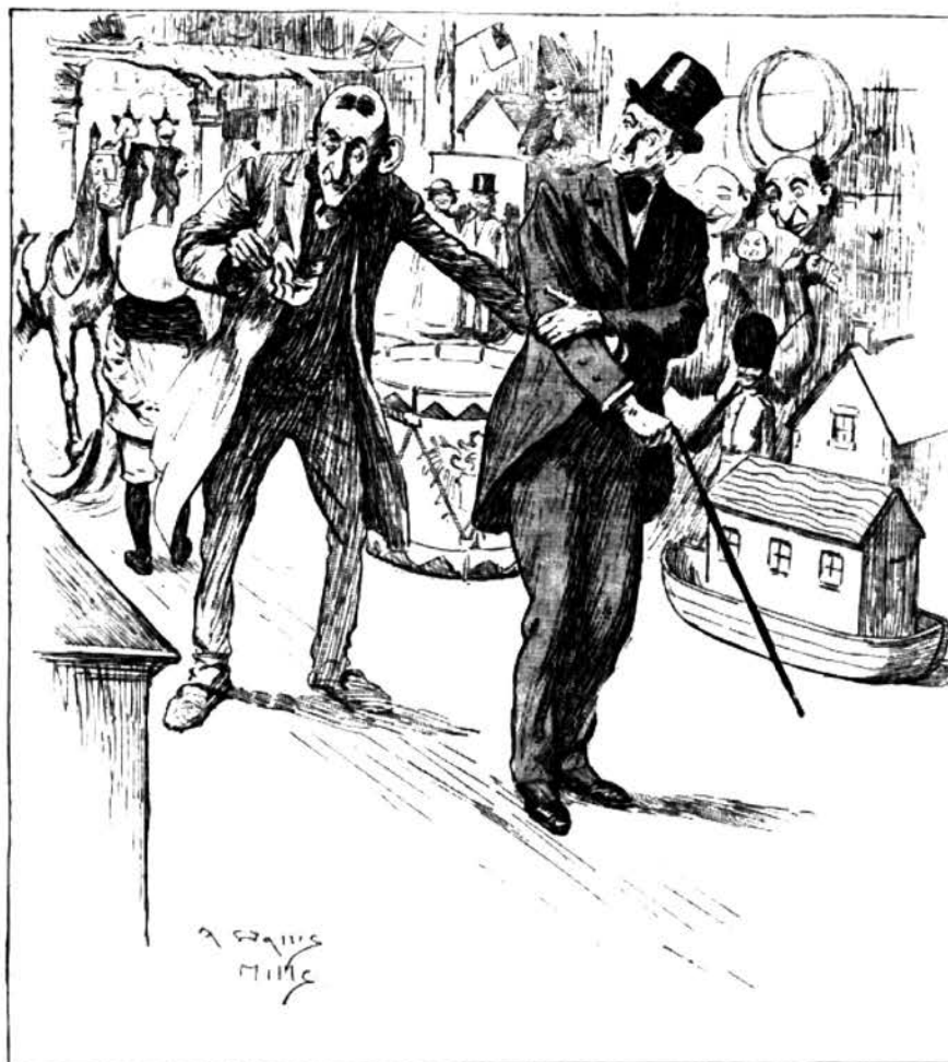
"HE HELD A LITTLE, WRIGGLING RED DEMON BY THE TAIL."

"All goods of the same quality," said the shopman, rubbing his flexible hands together, "and that is the Best. Nothing in the place that isn't genuine Magic, and warranted thoroughly rum. Excuse me, sir!"