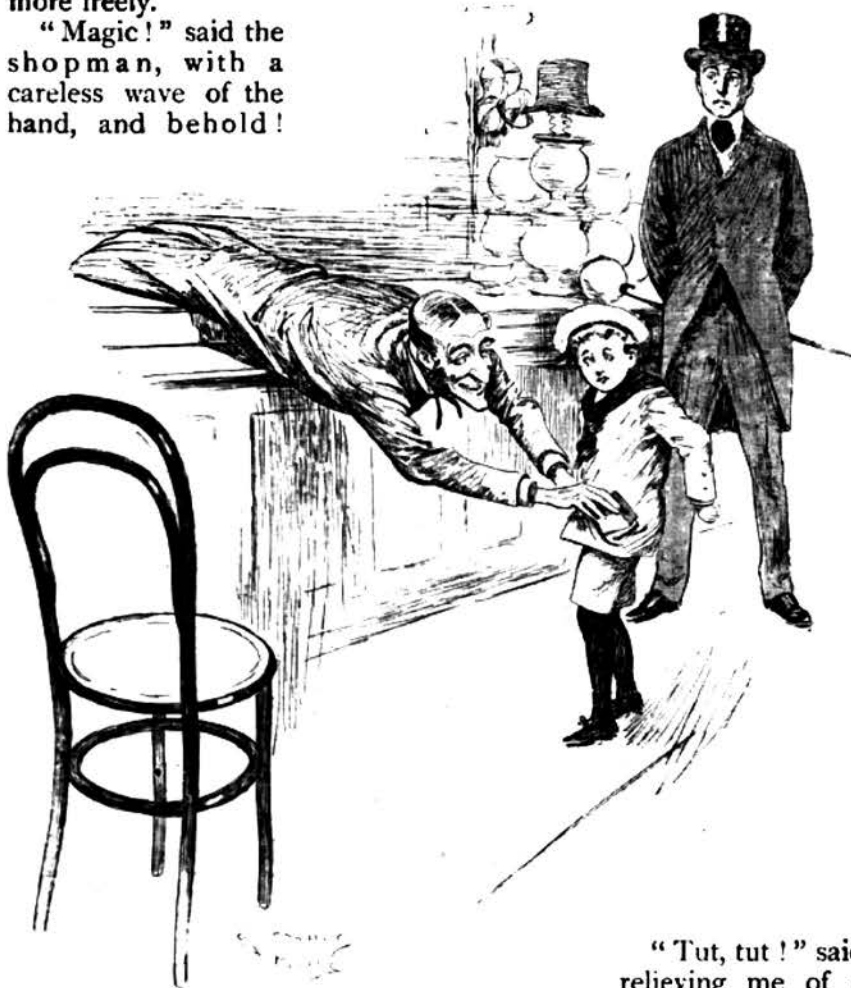
"THIS AMAZING PERSON PRODUCED THE ARTICLE IN THE CUSTOMARY CONJURER'S MANNER."

"Magic!" said the shopman, with a careless wave of the hand, and behold!