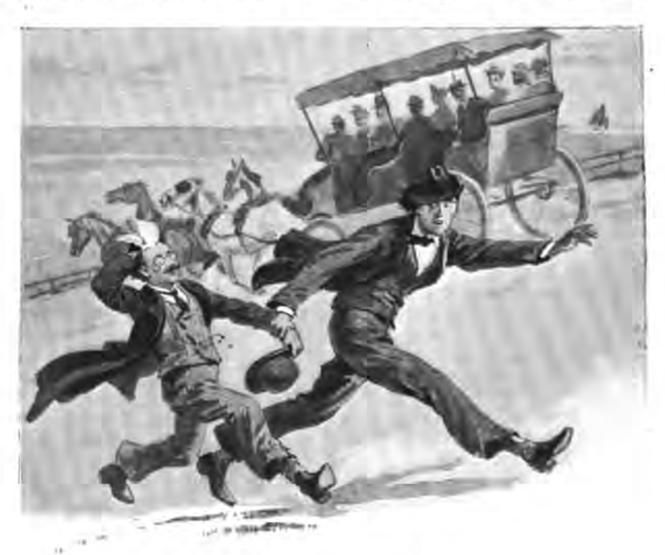
" I PANTED FOR MERCY."

"It does more, much more. It scares me. Come up and see the stuff. Taste it! Try it! It's the most amazing stuff on earth." He gripped my arm and, walking at such a pace that he forced me into a trot, went shouting with me up the hill. A whole char-à-banc-ful of people turned and stared at us in unison after the manner of people in chars-à-banc. It was one of those hot, clear days that Folkestone sees so much of, every colour incredibly bright and every outline hard. There was a breeze of course, but not so much breeze as sufficed under these conditions to keep me cool and dry. I panted for mercy.