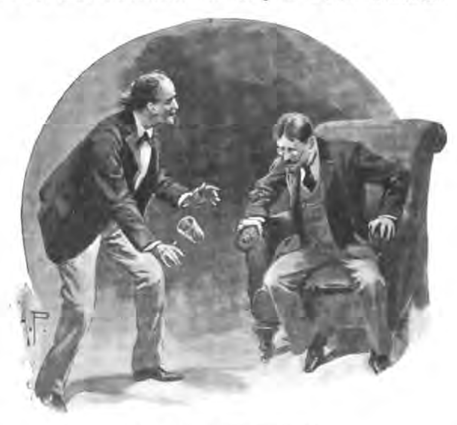
"IT HUNG IN MID-AIR-MOTIONLESS."

"And here," he said, and opened the hand that held the glass. Naturally I winced, expecting the glass to smash. But so far from smashing it did not even seem to stir; it hung in mid-air—motionless. "Roughly