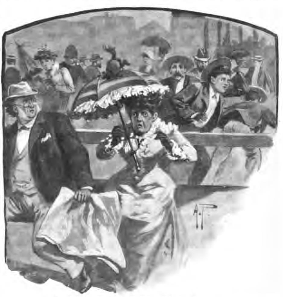
" PROPLE GOT UP AND TROD ON OTHER PEOPLE."

got out of tune-was arrested by the amazing fact, and the still more amazing yapping and uproar caused by the fact, that a respectable, over-fed lapdog sleeping quietly to the east of the bandstand should suddenly fall through the parasol of a lady on the west-in a slightly singed condition due to the extreme velocity of its movements through the air. In these absurd days, too, when we are all trying to be as psychic, and silly, and superstitious as possible! People got up and trod on other people, chairs were overturned, the Leas policeman ran. How the matter settled itself I do not know-we were much too anxious to disentangle ourselves from the affair and get out of range of the eye of the old gentleman in the bath-chair to