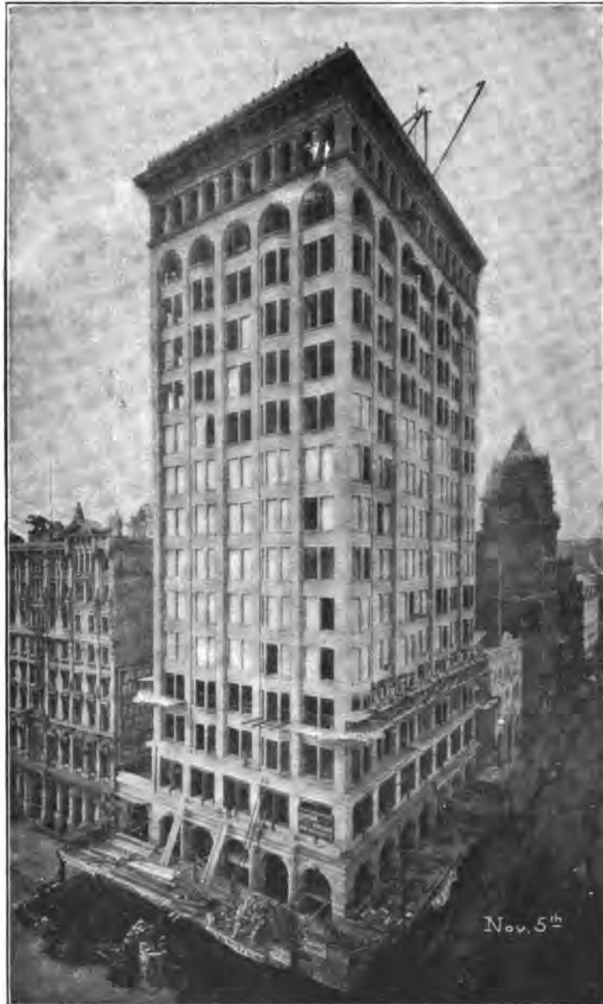
THE BUILDING OF A SKYSCRAPER—NOVEMBER 5TH. THE EXTERIOR PRACTICALLY COMPLETED.

built. There is nothing in the engineering problem to prevent the construction of a fifty-storey building, but such a sight will probably never vex the eye of man. Already various American cities are passing laws limiting the height of buildings. Moreover, many property-owners feel that time should be given to ascertain how the skyscraper will endure—whether the steel will weaken with rust, whether the foundations will hold true,