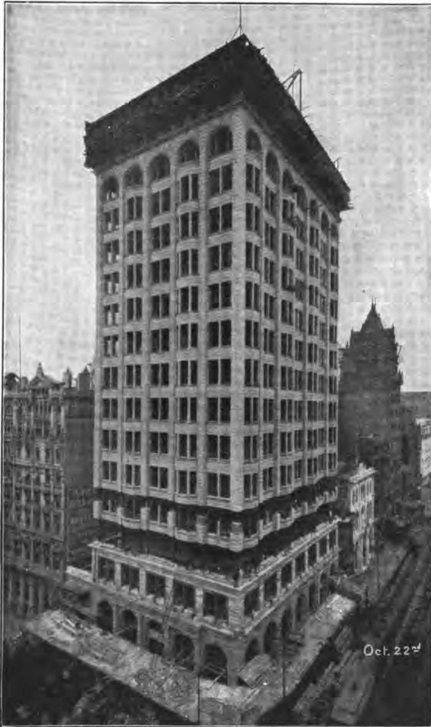
THE BUILDING OF A SKYSCRAPER—OCTOBER 22ND. THE ROOF IN PROGRESS.

put upon them is about 16 tons, a margin great enough to give any builder a sense of safety. Moreover, they are below the water-line, so that they are indestructible by the ordinary process of decay.