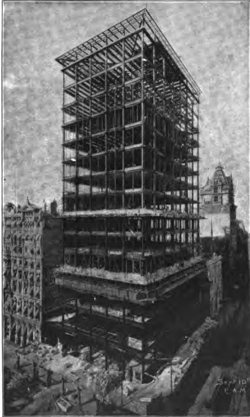
THE BUILDING OF A SKYSCRAPER—SEPTEMBER Tenth, FRAME COMPLETED—THE WALLS BEGUN AT THE FOURTH STOREY.

on every square foot of surface; the solid rock of New York will bear more. Moreover, he must determine exactly how much strain each steel girder, each column, even each rivet, will bear. If he overloads any single girder, he endangers his whole building. Then he must calculate how much wind is going to blow against his building, and from what direction most of it is coming; he must make provisions for supplying water to the