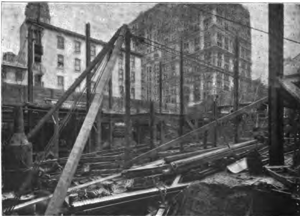
THE BUILDING OF A SKYSCRAPER—AS IT LOOKED JULY 30TH. THE FIRST OF A SERIES OF PICTURES TAKEN EVERY TWO WEEKS, SHOWING THE REMARKABLE RAPIDITY OF CONSTRUCTION OF A MODERN SKYSCRAPER.

Ten years ago, in 1889, there was not a “skyscraper” in the world; to-day there are scores of them in American cities, the heights varying from seven storeys up to thirty, making them by all odds the greatest structures reared by the hand of man. The idea of constructing a building like a bridge is said to have originated in Chicago; it has, indeed, been given the name “Chicago construction.” Some of the earliest buildings embodying the steel-cage idea were the Tacoma (completed in 1889), the Home Insurance, and the Rookery buildings of Chicago, and the Drexel Building in Philadelphia. Nearly all