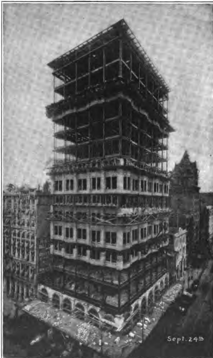
THE BUILDING OF A SKYSCRAPER—SEPTEMBER 24TH. THE WALLS BEGUN AT FIVE DIFFERENT POINTS.

To begin with, it has twenty-nine storeys, and its height from the sidewalk to the tops of the cupolas on the towers is 390ft. Thus it is over 100ft. taller than the dome of the Capitol at Washington, 85ft. above the Statue of Liberty, and within a very few feet of the