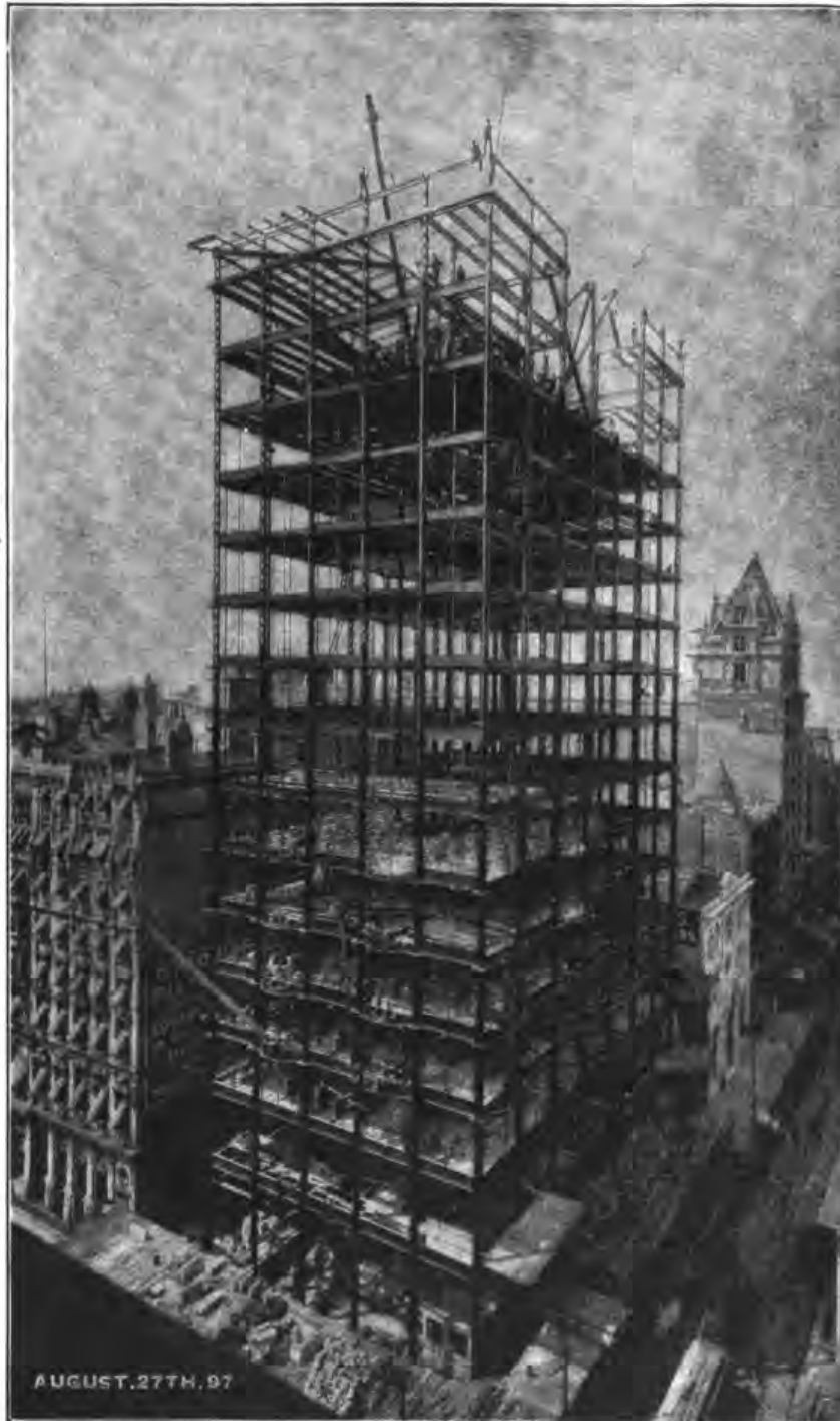
THE BUILDING OF A SKYSCRAPER—AUGUST 27TH. THE FRAME FIFTEEN STOREYS ABOVE THE GROUND.

The building of a modern skyscraper is a mighty task, full of difficult problems, more difficult even than those connected with a great steamship, a great bridge, or even a railroad line. Knowing how far the building is going up, the architect must determine from the character of the ground on which it is to stand how far it must go down. In New York many of the greatest buildings have foundations so deep that they