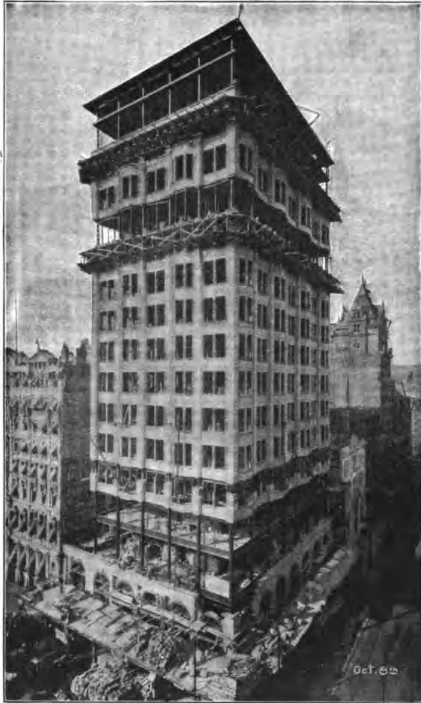
THE BUILDING OF A SKYSCRAPER—OCTOBER 8TH. THE WALLS HALF FINISHED.

land were denuded to furnish the 1,200 great pine piles, some of them 40ft. long, which were driven into the sand of the site. These piles are in rows, two feet apart, under the vertical columns which support the building. They were driven into the ground as far as they would go under the blows of a one-ton hammer. They are thus prepared to sustain a weight of 20 tons, although the most that will be