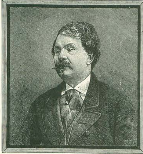
CAPT. MAYNE REID, AGE 53.

MY DEAR YOUNG FRIEND,—Allow me to present you with the enclosed portrait, which, I believe, is the best yet taken of me, and which I have not permitted to be published. I am glad to hear that your father is by the side of Garibaldi, and I am sure no truer friend to the hero of Italy and Liberty can be found in England. I knew Garibaldi as a heroic apostle of freedom long before his