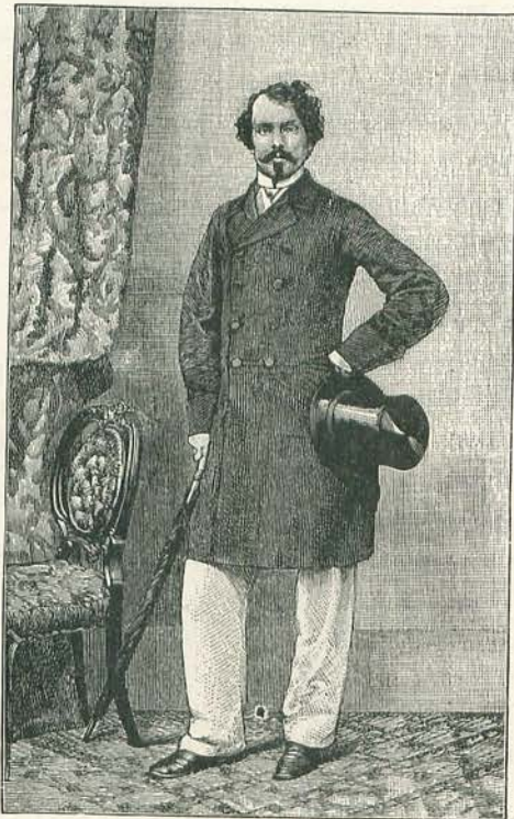
CAPT. MAYNE REID, AGE 46

Mayne Reid greatly distinguished himself at the capture of Vera Cruz, at the battle