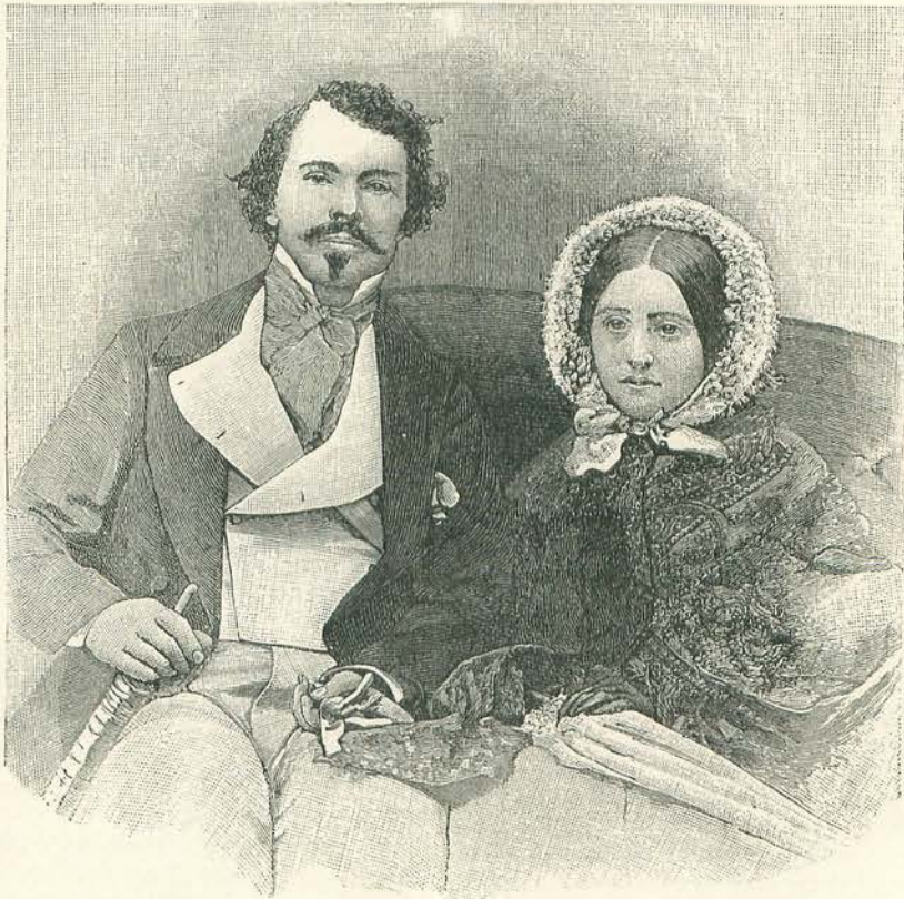
CAPT. MAYNE REID AND HIS CHILD WIFE.

Captain Reid had, like many of his literary brethren, reverses and pecuniary misfortunes. At Gerrard's Cross, near Slough, he embarked in rather extensive building operations, erecting a house for himself of Mexican design, some cottages, and a reading-room, which eventually involved him