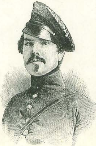
LIEUT. MAYNE REID, AGE 29.

purpose, he set out for Mexico, where he landed in 1838, and had experiences of the wild and riotous life which was then the distinguishing feature of New Orleans. Leaving the Crescent City he disappeared for a while to enjoy a backwoods existence, and for several years his life abounded in incidents, fully as romantic and exciting as those afterwards detailed as occurring to the heroes of his own works of fiction. In the companionship of trappers, he sojourned with Indians, and took part in their forays when they were a powerful and warlike race, and travel in their hunting grounds involved danger, for in those days "wild in woods, the noble savage ran" in, so to speak, his primal state, uncontaminated by the effacing influences of modern civilisation. The prairie was then Mayne Reid's home, the wild mustang his steed; buffaloes and "grizzlies" his game; his comrades redskins, each, in the words of Longfellow,