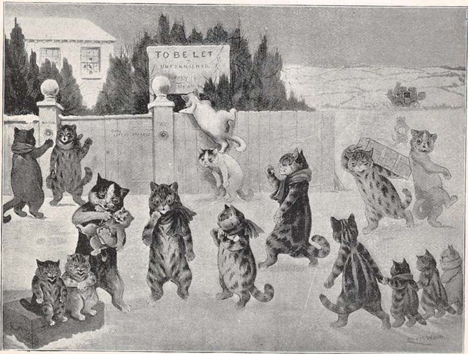
THE CHRISTMAS INVITATION : A HOAX. Drawn by Louis Wain.

Yes, the man who can draw has a great power in his hands, and it is well, as in the pictures we have chatted about, when the pencil is used to give innocent pleasure. There are higher forms of art than this, but there are few which give greater enjoyment to a greater number, and we are glad to be able to present the pictures to our readers and to wish them all as merry a time as the merriest and happiest to be found in our Christmas Picture Gallery.