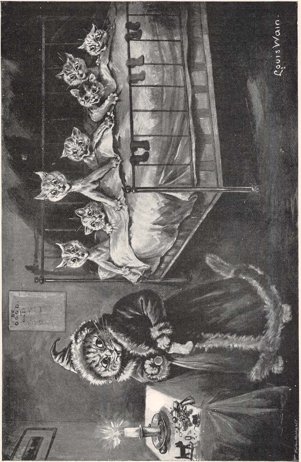
THE COMING OF SANTA CLAUS. By Louis Wain.