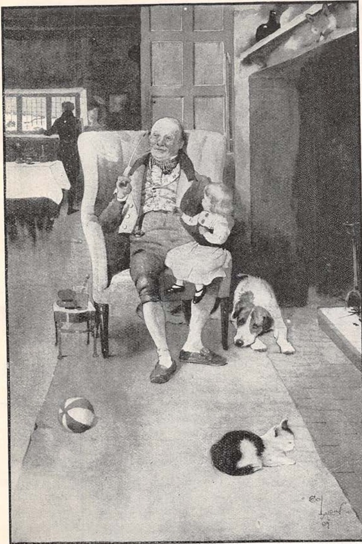
A QUIET CHRISTMAS. Drawn by Cecil Aldin.

slide before we ran. This time, the corner is very near and the policeman very nimble, but,—alas for the hopes of men,—the prey which was well-nigh in his clutches, eludes his grasp and down he comes on the very slide it was his duty to prohibit. A fearful joy is depicted on the faces of the children, while the bigger and rougher boys on the top of the bank, who have probably often been “chivvied” by this self-same policeman, have the utmost difficulty in controlling their risibles. The children themselves have probably been counting their “Christmas Bumps” and here is Mr. Peeler himself actually