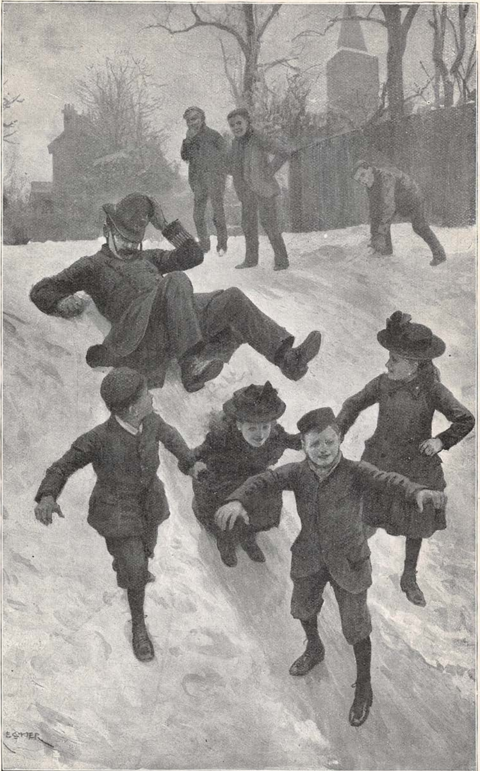
JUSTICE ON THE HEELS OF CRIME. From the drawing by Forestier.