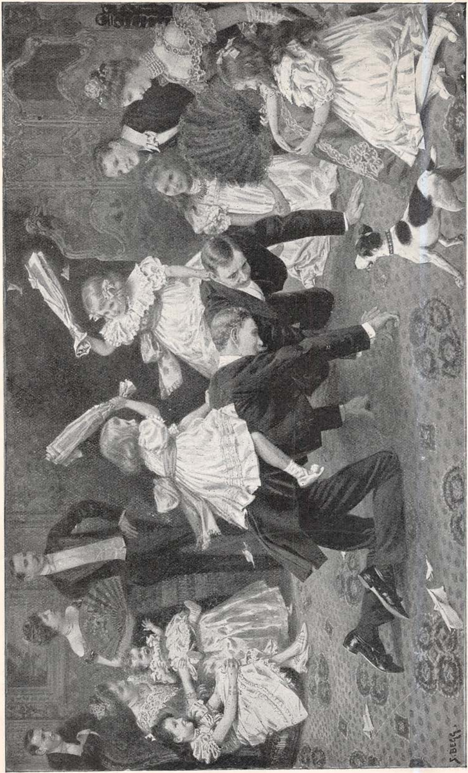
THE TOURNAMENT. From the painting by S. Begg.