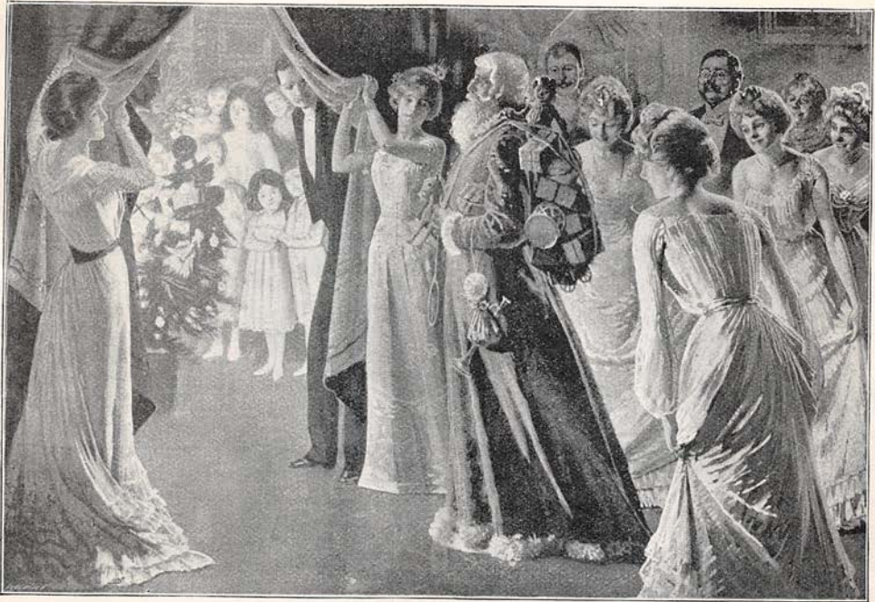
THE COMING OF SANTA CLAUS. Drawn by Lucien Davis, R.I.

summer and Christmas there, from our point of view, is all topsy-turvy. But here, in the old country, what a joy a good old-fashioned Christmas-cardy Christmas is, when the eaves are hanging with icicles, when the pond is frozen hard enough for a waggon to drive over it, and when every ironmonger's shop-window is beplastered with the magic word "Skates"!