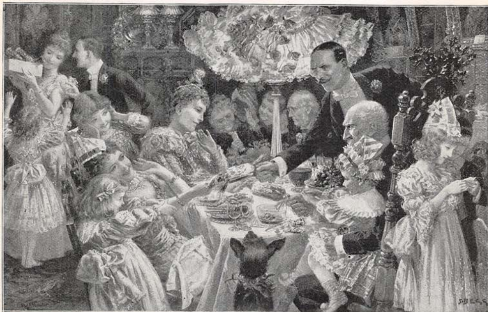
CRACKERS.