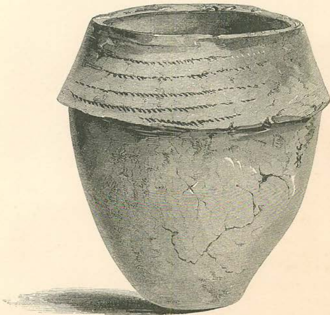
No. 4. Height, 9\frac{1}{2} in. Diam. 8\frac{1}{2} .

Urns discovered, April, 1852, in Excavations at Matlow Hill, near the Flcam Dyke, by the Hon. Richard C. Neville.