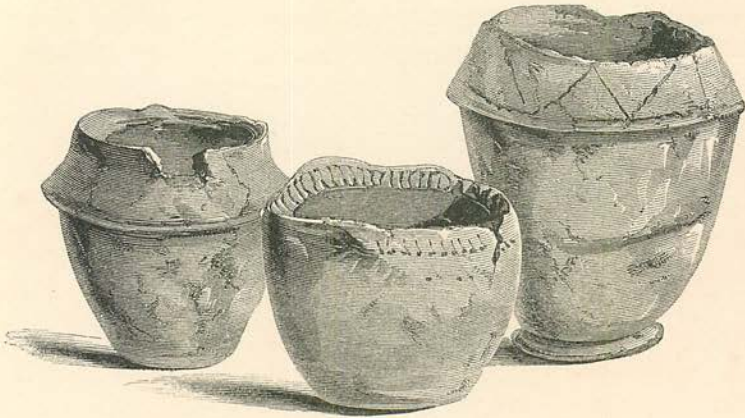
No. 5. Height, 3\frac{1}{2} in. Diam., 4 in.