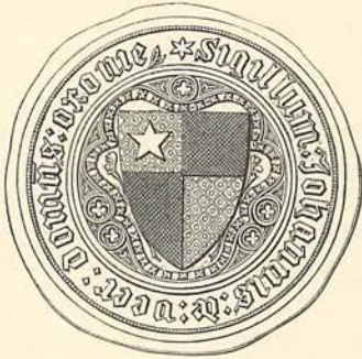
Privy Seal of John de Vere, seventh Earl, a.d. 1331-1360.