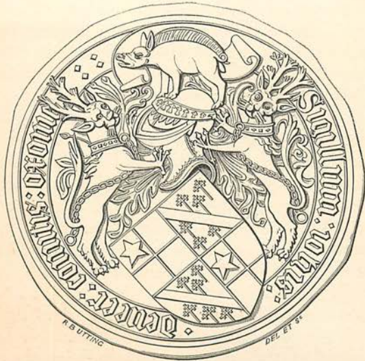
John de Vere, thirteenth Earl, a.d. 1417-1461.