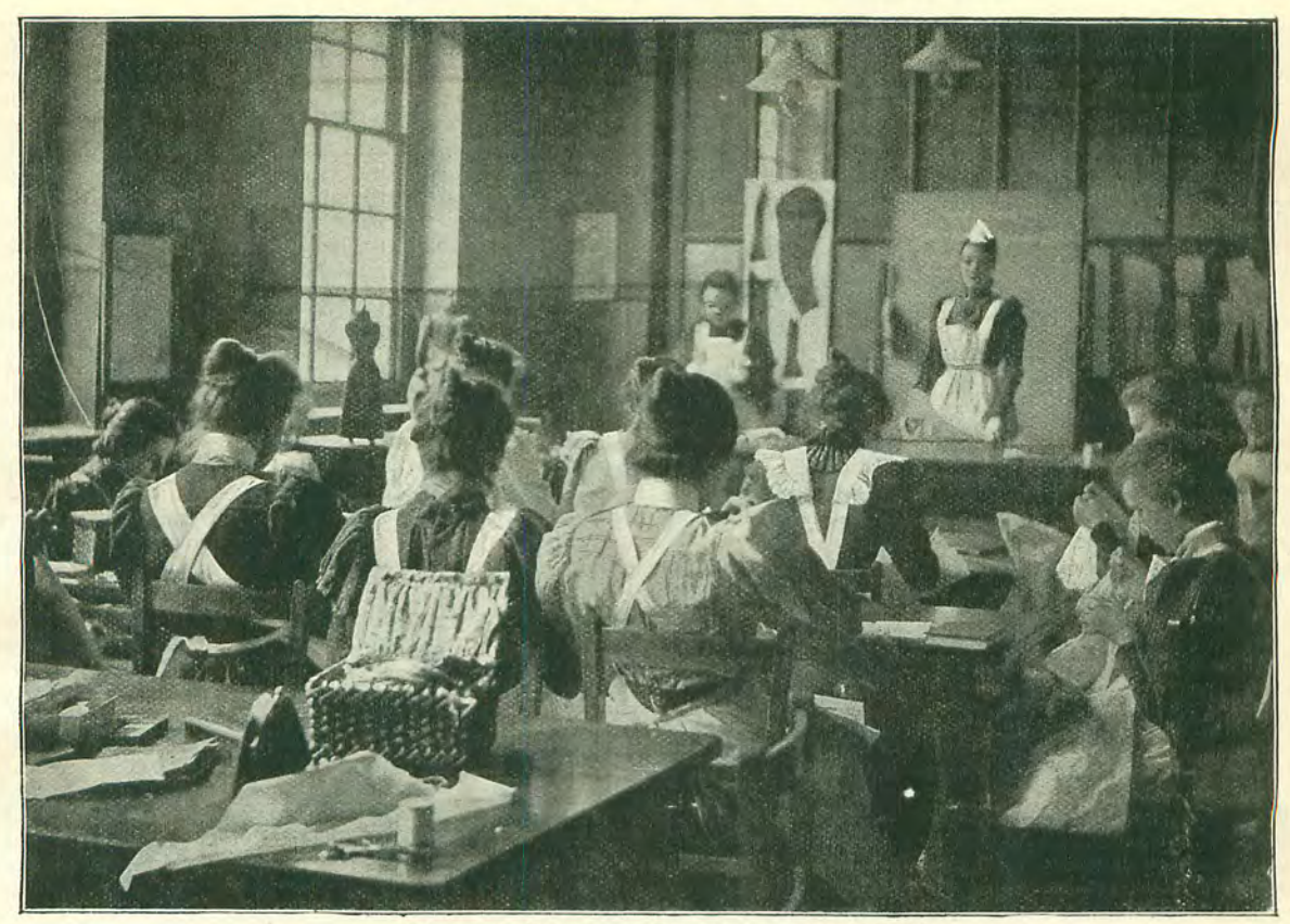
A NEEDLEWORK CLASS, BATTERSEA POLYTECHNIC.