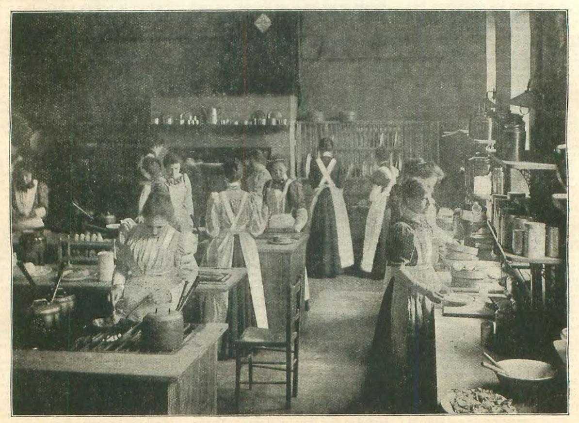
THE COOKERY SCHOOL, POLYTECHNIC. STUDENTS AT WORK.