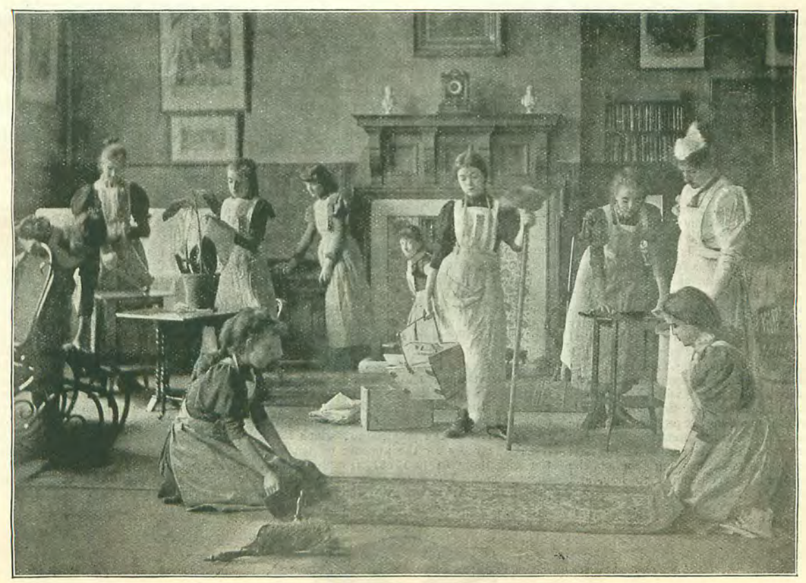
A HOUSEWIFERY CLASS AT BATTERSEA POLYTECHNIC.

Seeing this, the Technical Education Board of the London County Council five years ago began to establish, one after another, Schools of Domestic Economy to which girls should go for five months at a time after leaving the ordinary schools, and where they should be occupied for the whole school hours five days a week in household work, thus giving them