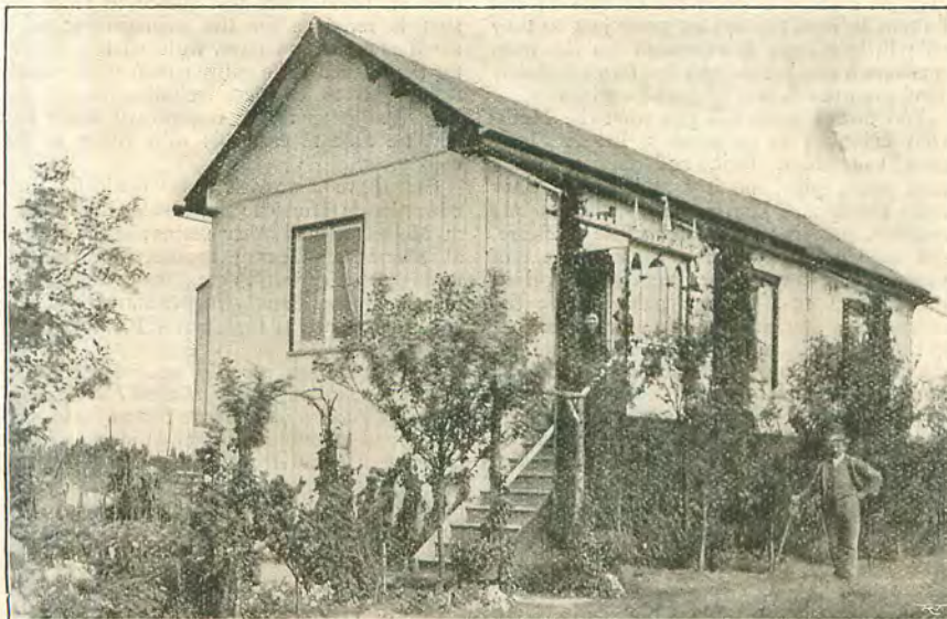
LARGE FRUIT AND VEGETABLE STOREHOUSE WITH DWELLING-ROOMS OVER.

"A quiet resting-place— Refreshment for the mind."