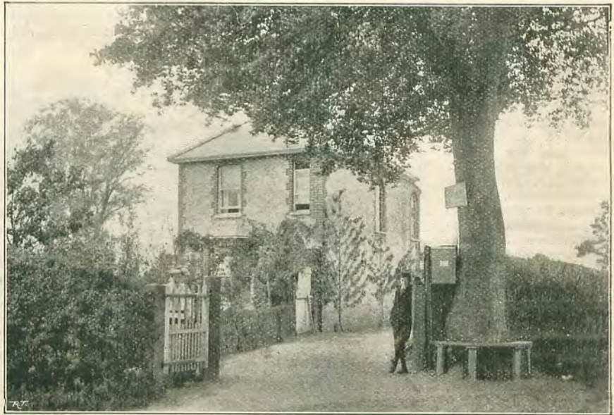
VIEW OF FOUNDER'S HOUSE, WITH OUTSIDE SEAT FOR WAYFARERS.

THERE are two weighty questions much debated at present, in every family where there are young people of both or either sex growing up, and needing some provision to be made for their future living and maintenance. If the family fortune be not enough to supply more than a certain amount of education, or a few hundreds of pounds for an outfit and settlement, the questions of "Where shall we send him? What shall we do with her?" become even more puzzling still. Formerly it was only the boys who had to be thought of, now the girls also claim their share of education; which, if not professional, must be one of an advanced and excellent kind, or they cannot expect to compete with their fellows in life. Every girl does not want to be a doctor, and the profession of a nurse is much overstocked; the Civil Service will not provide for every one; and though music and the arts take some, perhaps, off our hands, we are still confronted with the question, for boys as well as girls: How can they make a living in the world of to-day? What a relief from these anxieties it would be were it once demonstrated without a doubt, that an opening