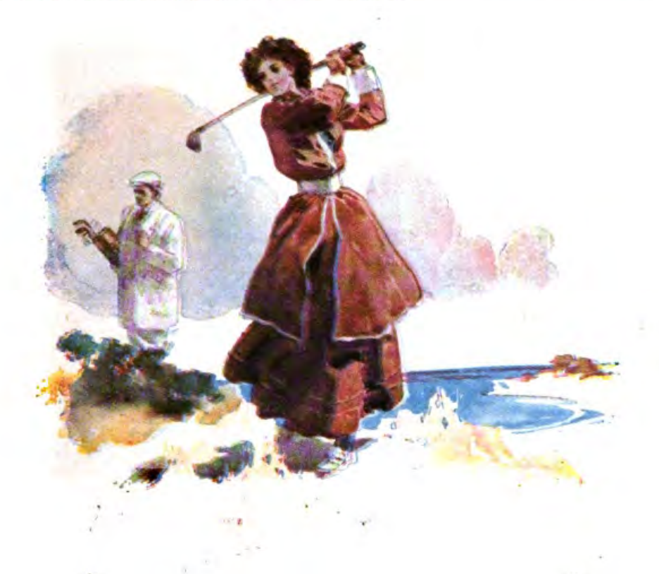
"HE HAD GONE DUMBLY ROUND THE LINKS WITH HER."

"'Is lordship, sir, 'ave climbed a tree, and Reuben is at the foot, gruffling at 'im, very fierce."