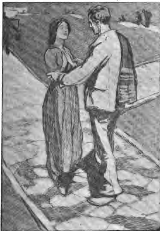
"HE HAD A FEW MINUTES WITH MEDINA-SAROTÉ BEFORE SHE WENT APART TO SLEEP."

He had fully meant to go to a lonely place where the meadows were beautiful with white narcissus, and there remain until the hour of his sacrifice should come, but as he walked he lifted up his eyes and saw the morning, the morning like an angel in golden armour, marching down the steep.