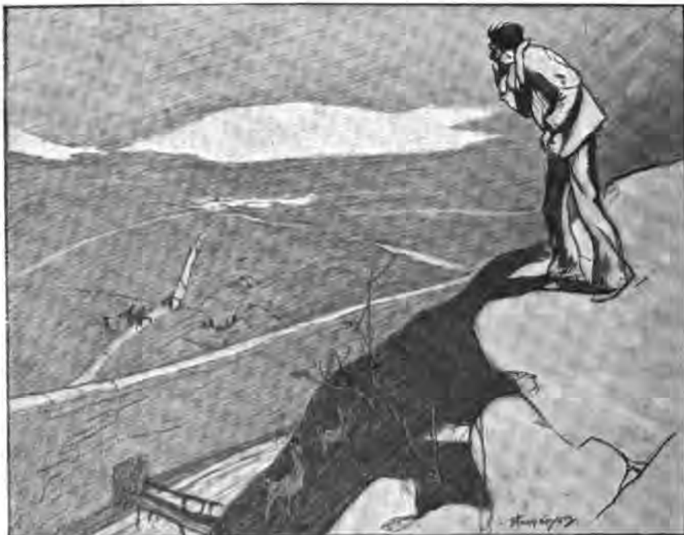
"NUÑEZ STOOD FORWARD AS CONSPICUOUSLY AS POSSIBLE UPON HIS ROCK."

He descended a steep place, and so came to the wall and channel that ran about the valley, near where the latter spouted out its surplus contents into the deeps of the gorge in a thin and wavering thread of cascade. He could now see a number of men and women resting on piled heaps of grass, as if taking a siesta, in the remoter part of the meadow, and nearer the village a number of recumbent children, and then nearer at hand three men carrying pails on yokes along a little path that ran from the encircling wall towards the houses. These latter were clad in garments of llama cloth and boots and belts of leather, and they wore caps of cloth with back and ear flaps. They followed one another in single file, walking slowly and yawning as they walked, like men who have been up all night. There was something so