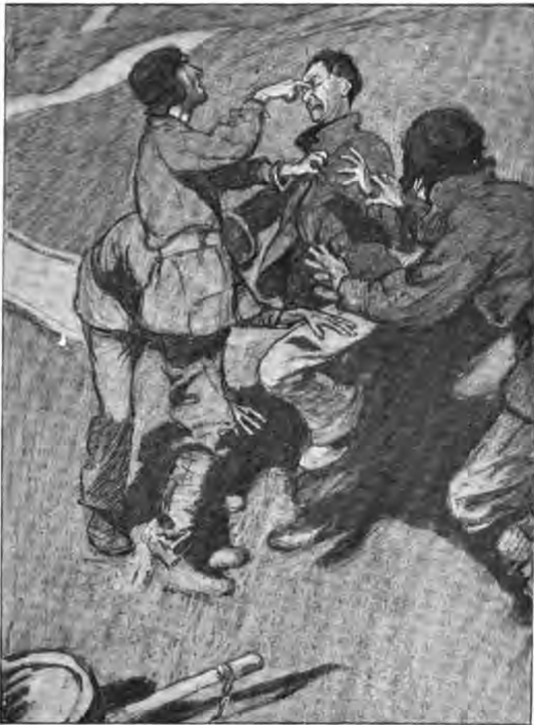
"'CAREFULLY,' HE CRIED, WITH A FINGER IN HIS EYE."

number of figures gathering together in the middle roadway of the village.