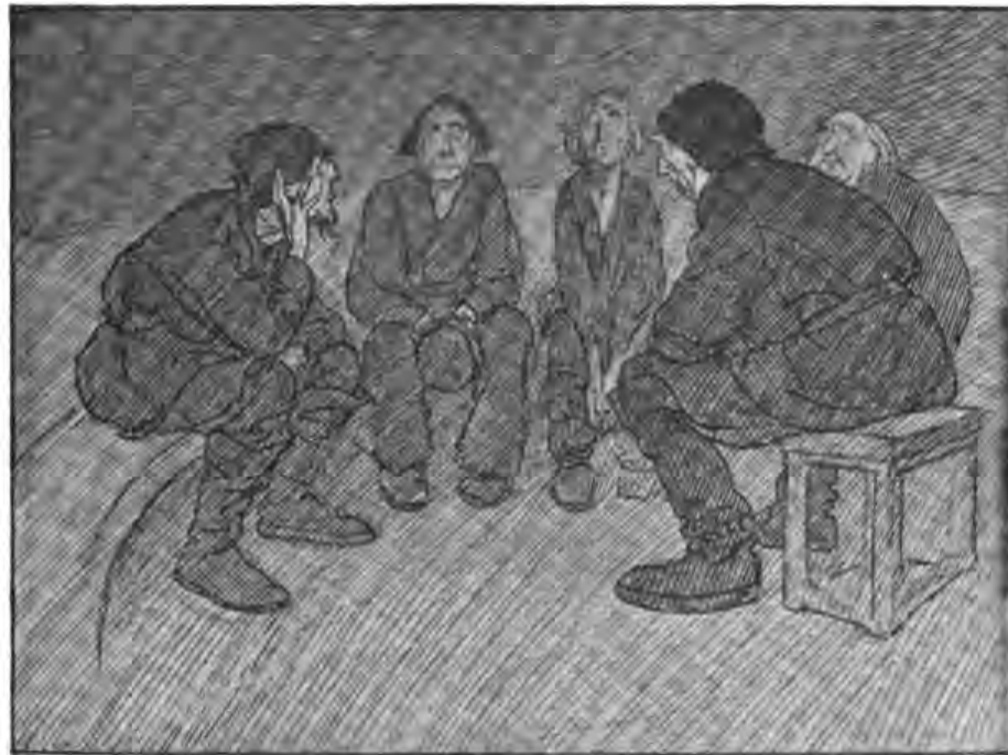
"'HIS BRAIN IS AFFECTED,' SAID THE BLIND DOCTOR."

"You do not want me," he said, "to lose my gift of sight?"