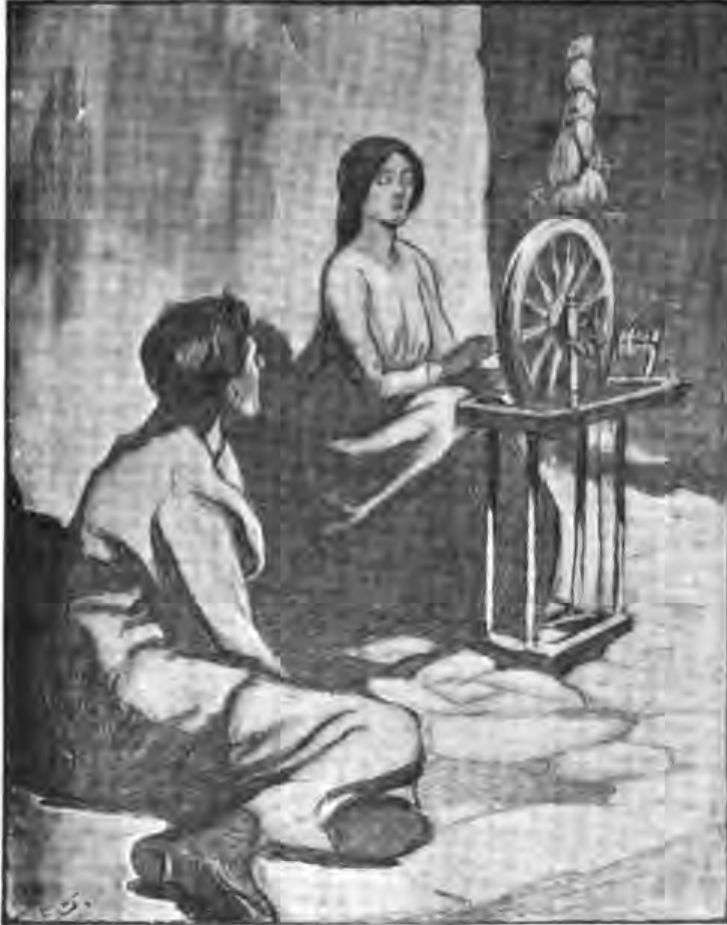
"HE SAT DOWN AT HER FEET."

He went to her one day when she was sitting in the summer moonlight spinning. The light made her a thing of silver and mystery. He sat down at her feet and told her he loved her, and told her how beautiful she seemed to him. He had a lover's voice,