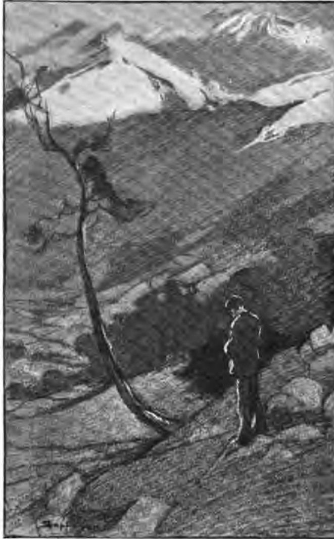
"THE GLOW UPON THE SNOW-FIELDS AND GLACIERS WAS THE MOST BEAUTIFUL THING HE HAD EVER SEEN."

all their methods and procedure arose naturally from their special needs. Their senses had become marvelously acute; they could hear and judge the slightest gesture of a man a dozen paces away—could hear the very beating of his heart. Intonation had long replaced expression with them, and touches gesture, and their work with hoe and spade and fork was as free and confident as garden work can be. Their sense of smell was extraordinarily fine; they could distinguish individual differences as readily as a dog can, and they went about the tending of llamas, who lived among the rocks