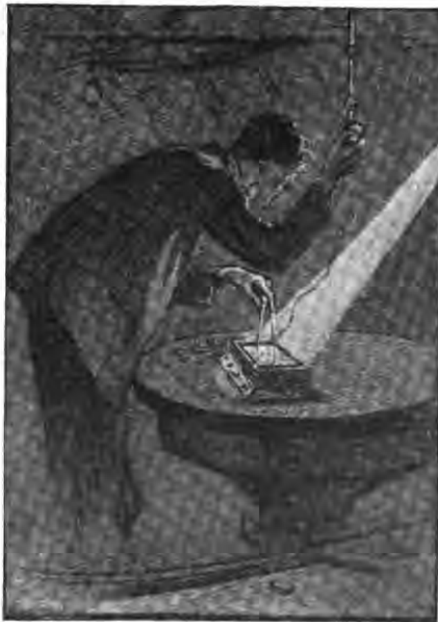
"THE PICTURE PASSED TO AND FRO LIKE AN AGITATED PANORAMA."

He was a young man, healthy enough but by no means sun-tanned, and of a type of feature and expression that prevails in His Majesty's Navy: alert, intelligent, quiet. He