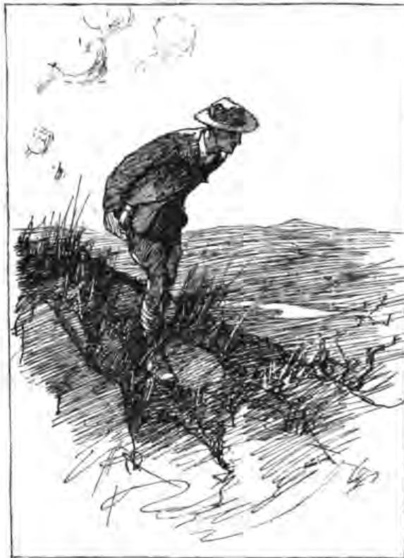
"HE DECIDED TO FOLLOW THE GULLY."

These were in the first place automatic, ejected their cartridges and loaded again from a magazine each time they fired, until the ammunition store was at an end, and they had the most remarkable sights imaginable, sights which threw a bright little camera-obscura picture into the light-tight box in which the rifleman sat below. This camera-obscura picture was marked with two crossed lines, and whatever was covered by the intersection of these two lines, that the rifle hit. The sighting was ingeniously contrived. The rifleman stood at the table with a thing like an elaboration of a draughtsman's dividers in his hand, and he opened and