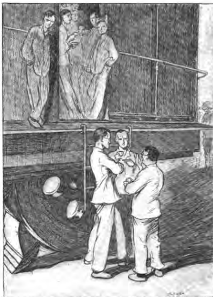
"SOMETHING NOT ALTOGETHER DEGRADED BELOW THE LEVEL OF A MAN."

And he was much too good a journalist to spoil his contrast by remarking that the half-dozen comparatively slender young men in blue pyjamas who were standing about their victorious land ironclad, drinking coffee and eating biscuits, had also in their eyes and carriage something not altogether degraded below the level of a man.