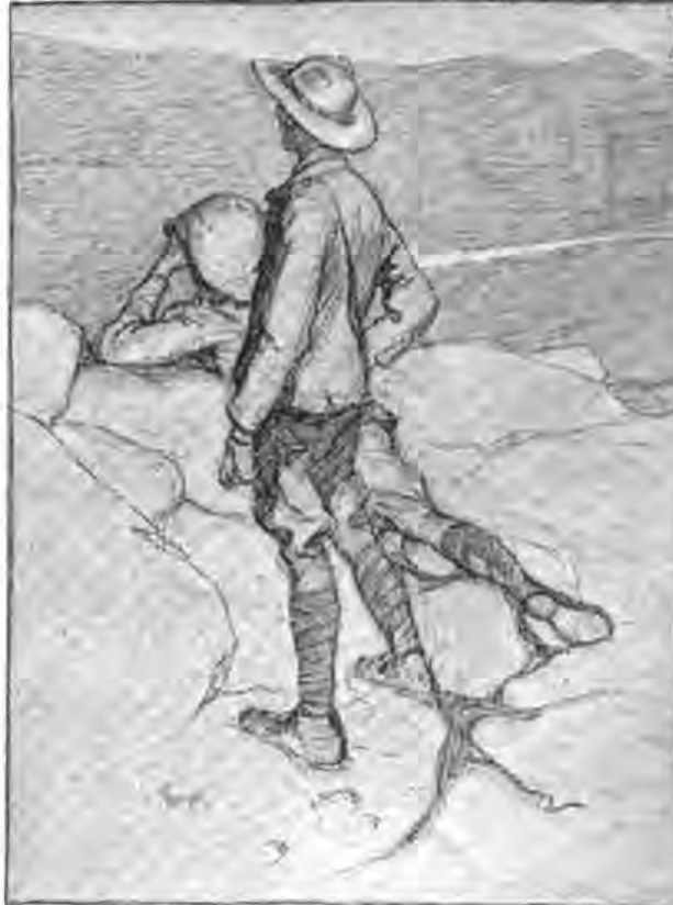
"'BOOM!' CAME FROM SOMEWHERE FAR AWAY TO THE LEFT."

The lieutenant shook his head. "There's nothing to see," he apologized, and then went down to where his little squad of sun-brown, loose-limbed men had been yarning in the trench. The war correspondent stood up also, glanced for a moment at the business-like bustle below him, gave perhaps twenty seconds to those enigmatical trees again, then turned his face toward the camp,