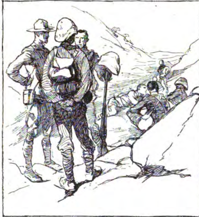
"HE HAD SPENT SOME HOURS IN THE COMPANY OF A SQUAD OF DISPIRITED RIFLEMEN."

rested, with a general air of being long, harmless sheds, in a pose of anticipatory peacefulness right and left of the picture, completely commanding two miles and more of the river levels. Emerged and halted a little from the scrub was the remainder of the defender's cavalry, dusty, a little disordered and obviously annoyed, but still a very fine show of men.