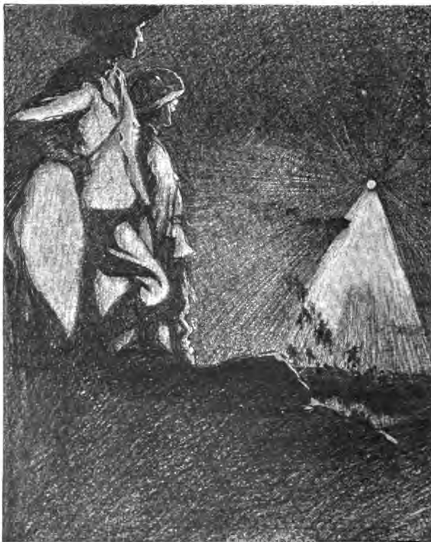
"SOMETHING ELSE BLACK AND SHINING LOOMED UP ON THE EDGE OF THE BEAM."

The war correspondent taxed his brain for some theory of conflict that would account for this, and was suddenly aware that the artist and he were vividly illuminated. He could see the ridge on which they stood, and before them in black outline a file of riflemen hurrying down towards the nearer trenches. It became visible that a light rain was falling, and farther away towards the enemy was a clear space with men—"our men?"—running across it in disorder. He saw one of those men throw up his hands and drop. And something else black and shining loomed up on the edge of the beam-coruscating flashes; and behind it and far away a calm, white eye regarded the world. "Whit, whit, whit," sang something in the air,