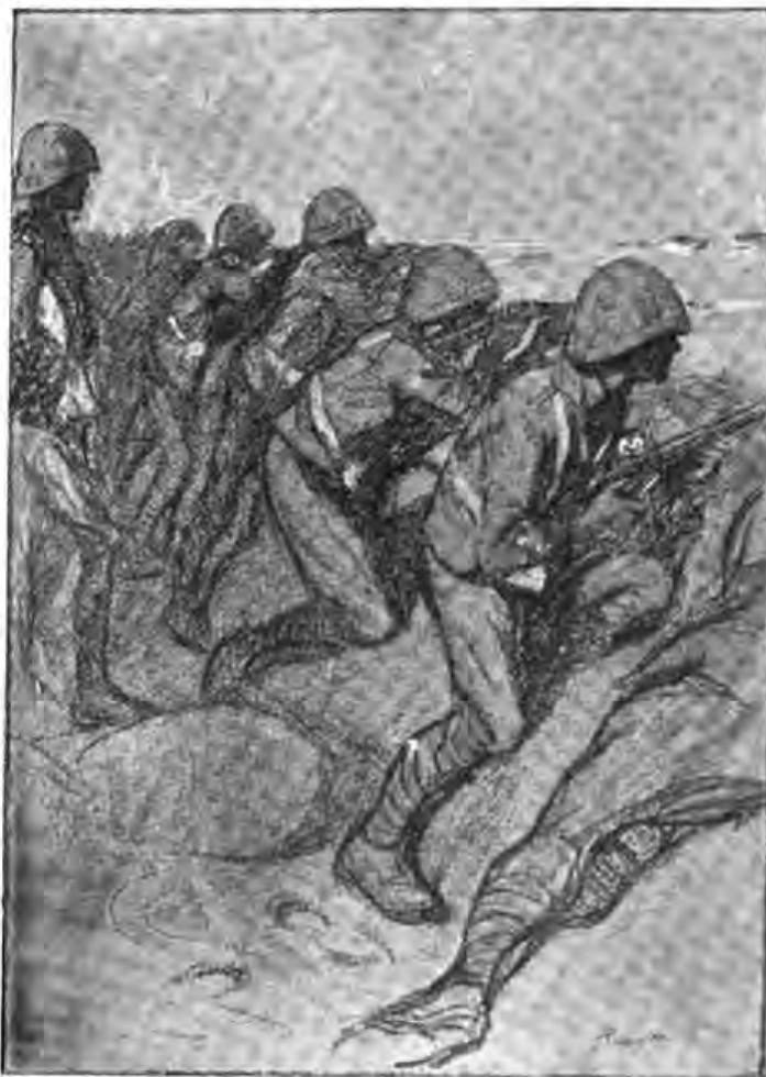
"THE MEN ABOUT HIM STUCK TO THEIR POSITION AND FIRED FURIOUSLY."

The lean man continued speaking for a word or so, then gave it up, shook his head to enforce the impossibility of anything crossing a trench like the one below, and resumed business once more.