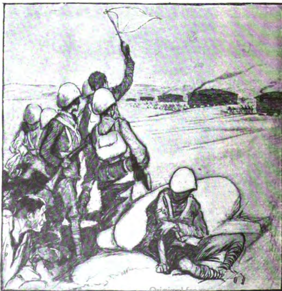
HERE AND THERE STOOD LITTLE CLUMPS OF MEN, OUTFLANKED AND UNABLE TO GET AWAY.

more than a hundred feet or so above the general plain, but in this flat region it sufficed to give the effect of extensive view. Away on the north side of the ridge, little and far, were the camps, the ordered waggons, all the gear of a big army; with officers galloping about and men doing aimless things. Here and there men were falling-in, however, and the cavalry was forming up on the plain beyond the tents. The bulk of men who had been in the trenches were still on the move to the rear, scattered like sheep without a shepherd over the farther slopes. Here and there were little rallies and attempts to wait and do—something vague; but the general drift was away from any concentration. Then on the southern side was the elaborate lacework of trenches and defences, across which these iron turtles, fourteen of them spread out over a line of perhaps three miles, were now advancing as fast as a man could trot, and methodically shooting down and breaking up any persistent knots of resistance. Here and there stood little clumps of men, outflanked and unable to get away, showing the white flag, and the