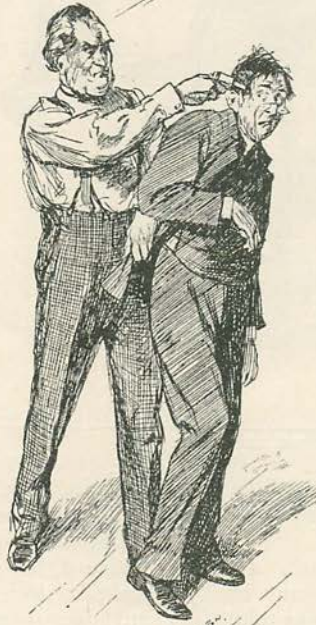
"HE POINTED HIS PISTOL AT MR. LEDBETTER'S HEAD."

So soon as the issue was decided, the stout man made Mr. Ledbetter take off his coat and roll up his shirt-sleeves, and, with the revolver at one ear, proceed with the packing his appearance had interrupted. From the stout man's point of view that was evidently the only arrangement, for if he had packed, he would have had to put down the revolver. So that even the gold on the table was handled by Mr. Ledbetter. This nocturnal packing was peculiar. The stout man's idea was evidently to distribute the weight of the gold as unostentatiously as possible through his luggage. It was by no means an inconsiderable weight. There was, Mr. Ledbetter says, altogether nearly £18,000 in gold in the black bag and on the table. There were also many little rolls of £5 bank-notes. Each rouleau of £25 was wrapped by Mr. Ledbetter in