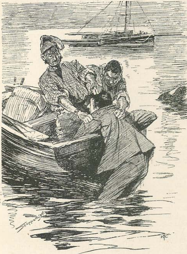
"THEY PULLED HIM ABOARD BY THE SHOULDERS AND HAIR.

where they put him, night and day, and in the night-time there were rats. The Orientals emptied his pockets and took his watch—but Mr. Bingham, being appealed to, took that himself. And five or six times the five Lascars—if they were Lascars—and the Chinaman and the negro who constituted the crew, fished him out and took him aft to Bingham and his friend to play cribbage and euchre and three-handed whist, and to listen to their stories and boastings in an interested manner.