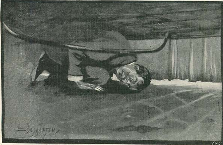
"THE POSITION WAS IN MANY RESPECTS AN ILL-ADVISED ONE."