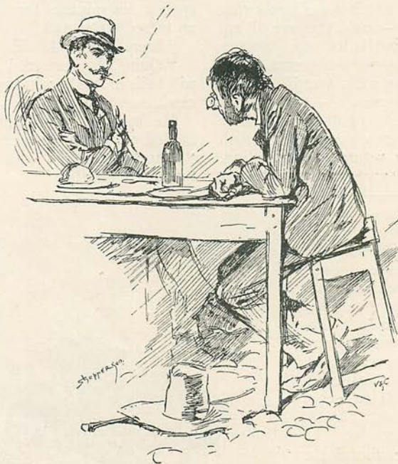
"AND THERE I GOT HIS STORY."

So the remarkable story of Mr. Ledbetter's Vacation ends. That breach with his aunt was not of long duration. The old lady had fully forgiven him before she died.