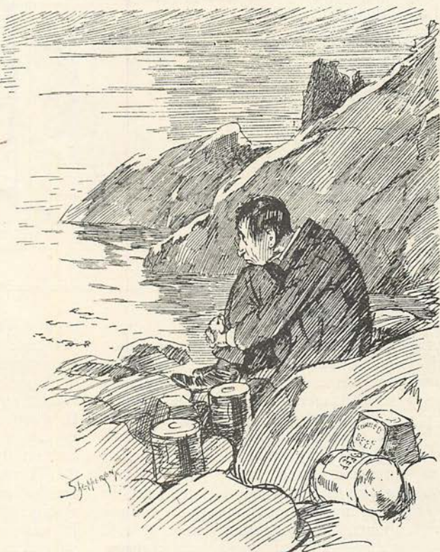
"SITTING BESIDE HIS CANS OF FOOD."

He stopped hopelessly. The man's tone tickled me. He seemed an odd character. "I am," he said, "one of the most unfortunate beings alive."