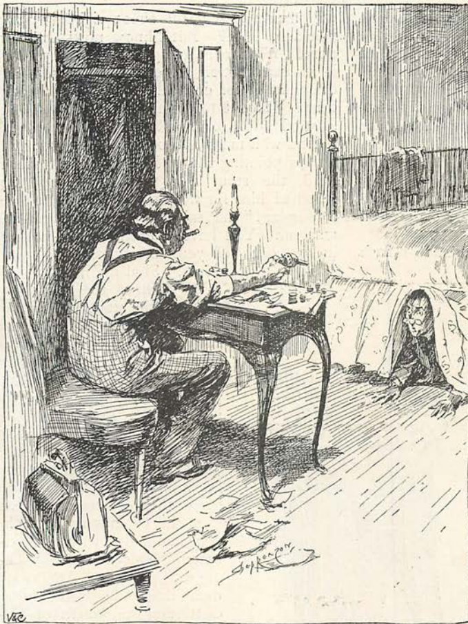
"COME OUT OF THAT, YOU SCOUNDREL!"

quiet concentration. "Come out. This side, and now. None of your hanky-panky—come right out, now."