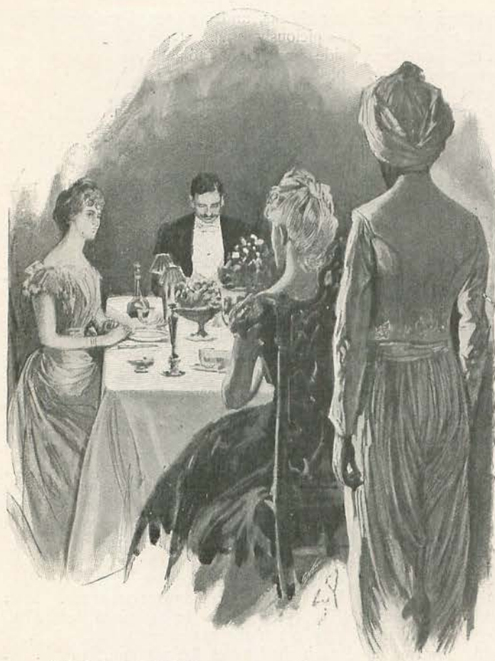
"SAMBO, THE BLACK SERVANT, STOOD BEHIND LADY SARAH'S CHAIR."