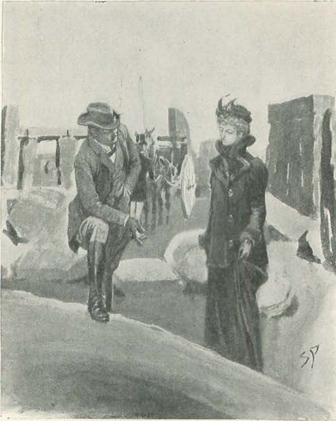
"THIS IS CALLED THE 'SLAUGHTER STONE.'"

"It is true," he answered. "These stones, dating back into the ages of the past, have always had a queer fascination for me. I love them almost as much as my mother does. She often comes here when her nerves are not at their best and wanders about this magic circle for hours."