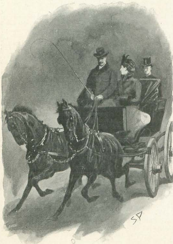
"I NOW SAW SOMETHING IN HIS APPEARANCE WHICH SURPRISED ME."

I did what I was bid. She gazed from her superior height into my eyes. As my eyes met