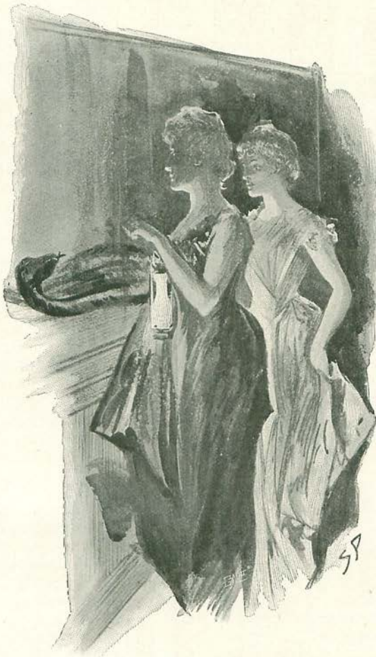
"WAKE UP, DARKEY!"

As she said the words it flashed across my