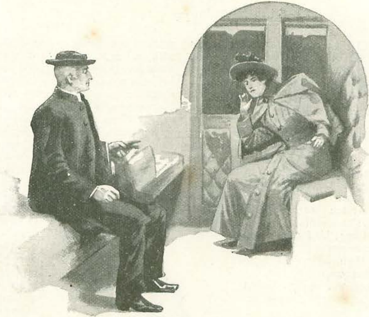
"AN ELDERLY CLERGYMAN."

"Bénédicté," he said, in a full and reverent voice.