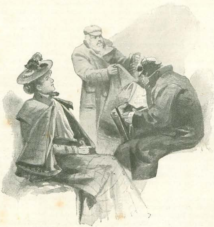
“MY TWO COMPANIONS WERE ALL ALIVE AND BRISK.”

I was awakened presently from quite a sound nap by the slowing of the train. It was coming into a great station, which I found was Chester. We must have passed Crewe while I was asleep. My two companions were now all alive and brisk. They were fastening