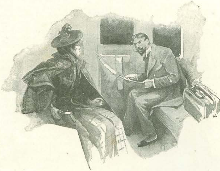
"HE HAD OPENED THE RAZOR."

at Euston, and I knew that you would be alone when you got to Chester. From Chester to Holyhead is a long run. The train is now comfortably on its way, and will not stop for nearly two hours. You see, therefore, that you are completely at my mercy. Your only chance of safety is in doing exactly what I tell you. Now, have the goodness to light that reading-lamp immediately."