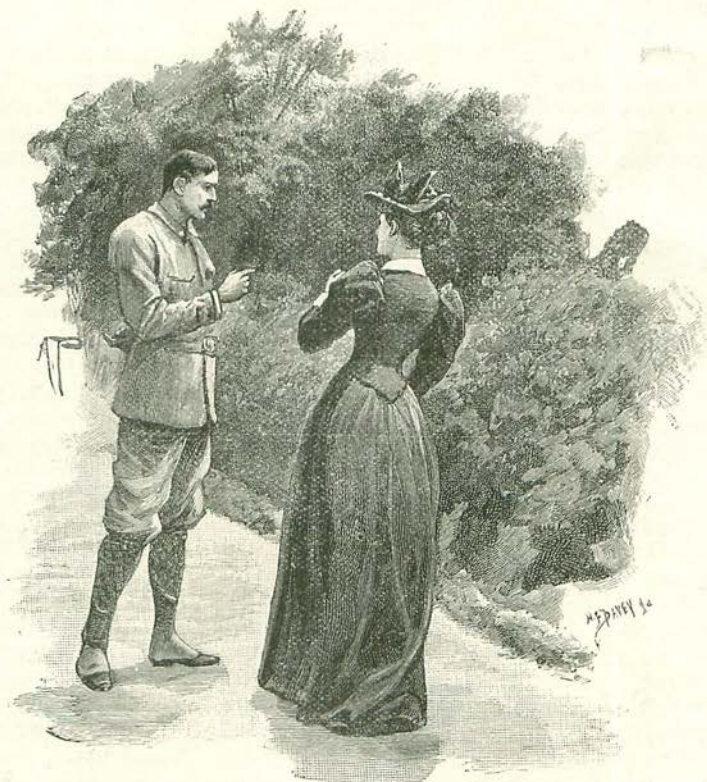
"I FELT AS IF I WERE SHOT!"

"You must be mad," he said. "For Heaven's sake don't inculcate yourself in that manner. As far as I am aware, I am the only person who, at present, suspects you. It has never, I know, even entered into Violet's head that you could have had anything to do with the robbery, and Lord and Lady Erstfield, I am sure, think you as innocent as themselves—they are the most loyal people in the world—they believe, and rightly, that they owe Violet's life to you. I don't think they could harbour an