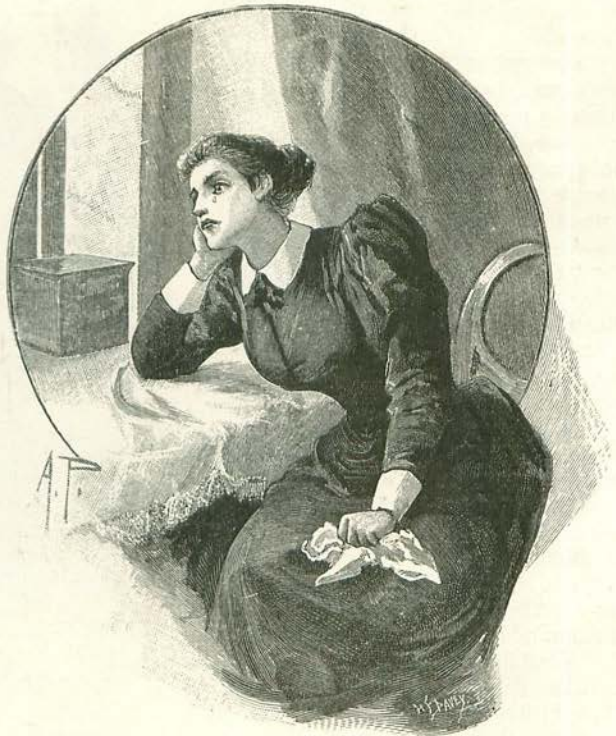
"I FELT TORN IN TWO."

to the house. Everything went on with outward smoothness, and the subject of the diamonds was by mutual consent never alluded to. Lady Violet grew worse, and the gay house party dispersed sooner than was intended. Captain Ponsonby stayed on, however. I met him occasionally, but we scarcely exchanged a word. I could see that he was anxious and haggard, but I set this down to his fears with regard to Lady Violet, who steadily refused to see him, and never left her bedroom and boudoir. I spent almost all my time with her, but as the days wore on I could not but feel the horror of my position more and more. I saw plainly that the suspicion which Captain Ponsonby harboured was shared by the two detectives, and also, in process of time, the poisonous thought was communicated to Lord and Lady Erstfield. Lady Erstfield's manner to me completely altered. Instead of treating me with almost the affection of a mother, she was cold and distant; she avoided meeting my eyes, and never spoke to me on any subject except what related to Violet's health. That is the position of affairs to-day, Dr. Halifax. I am suspected of the most horrible theft, and have not a chance of clearing myself. Lady Violet alone