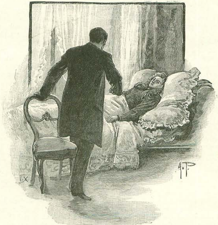
"DRAWING A CHAIR FORWARD, I SAT DOWN BY MY PATIENT."

"The symptoms of which you complain are clearly due to an over-wrought imagina-