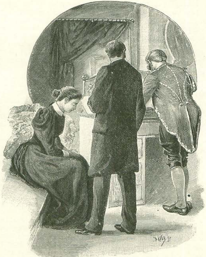
"HE APPROACHED LADY VIOLET'S WRITING-DESK AND DISTURBED A BOOK OR TWO."

"One of the servants," I replied; "never