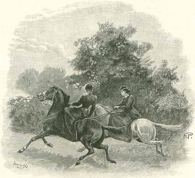
"THE GIRLS RODE TOGETHER."

Miss Temple's first letter was followed in the course of time by another, which was even more hopeful than the first. Lady Violet was devotedly attached to her, and could scarcely bear her out of her presence. The girls rode together, walked together,