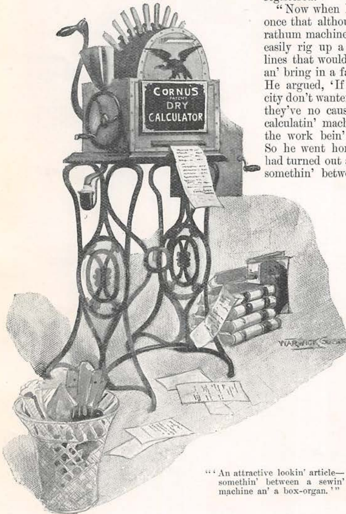
"An attractive lookin' article—somethin' between a sewin' machine an' a box-organ."

"Silas made a sight of dollars out of Athens, but he didn't do much with it in other cities. Outside that centre of learnin'