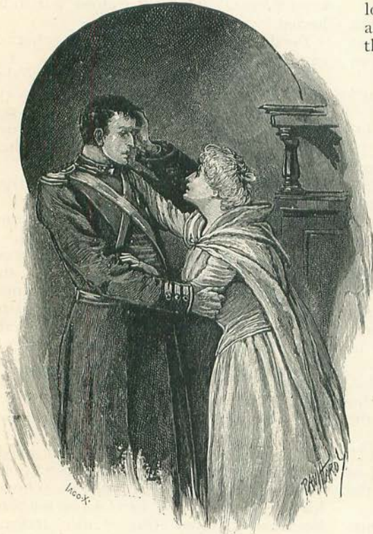
"GREAT HEAVENS! WHAT HAS HAPPENED?"

"You are right, George, it is not I who would love you no more, but you who would hate me. We must resign ourselves to our fate. Give me your hand, George;