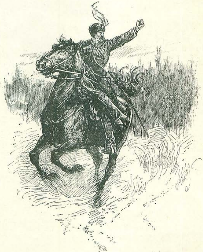
"A LAST MALEDICTION."

He uttered a deep sigh, then shook his head, as if with that he could disperse his gloomy thoughts.