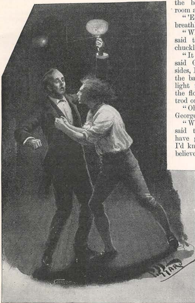
"Hirst, a ludicrous but pitiable figure, clung to him, trembling."

The waiter obeyed hastily. Hirst, a ludicrous but pitiable figure in knee-breeches and coat, a large wig all awry, and his