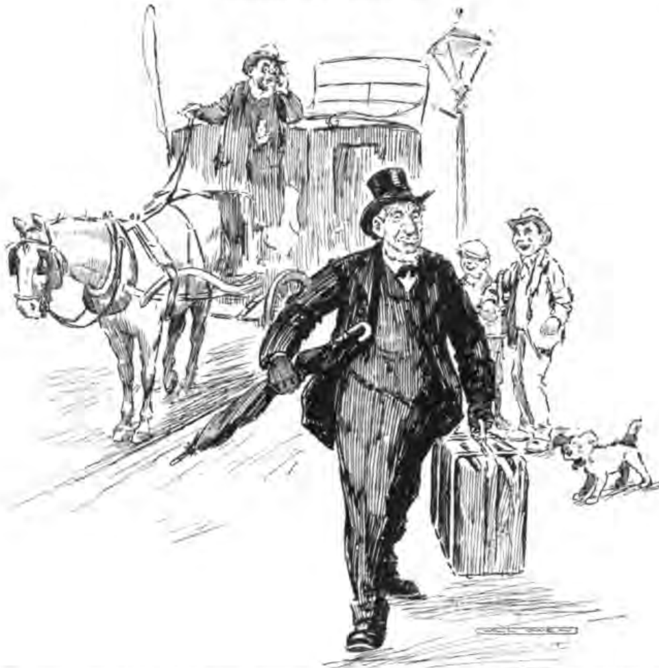
"MR. GOODMAN CAME IN A FOUR-WHEEL CAB WITH A BIG BAG AND A FAT UMBRELLA."

piece o' cake each. When they come out o' there they all walked about looking at the shops until they was tired out, and arter wot Mr. Goodman said was a very improving evening they all went 'ome.