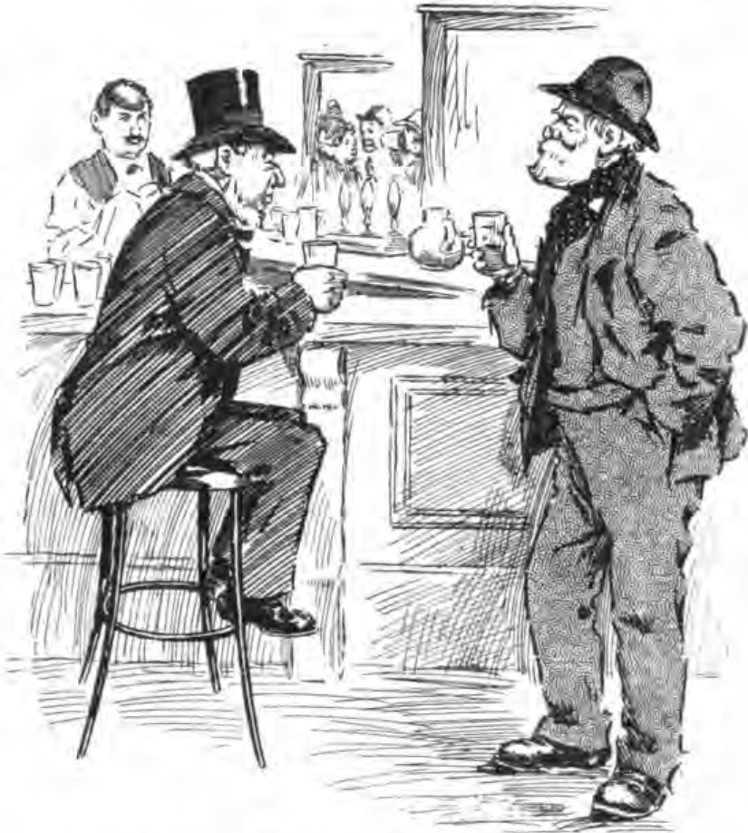
“‘IT AIN'T SO 'ORRID AS I 'AD FANCIED,' SES SAM.”

"He ain't so bad," ses Sam, wondering whether he ought to tell 'im 'arf of wot Peter really was like.