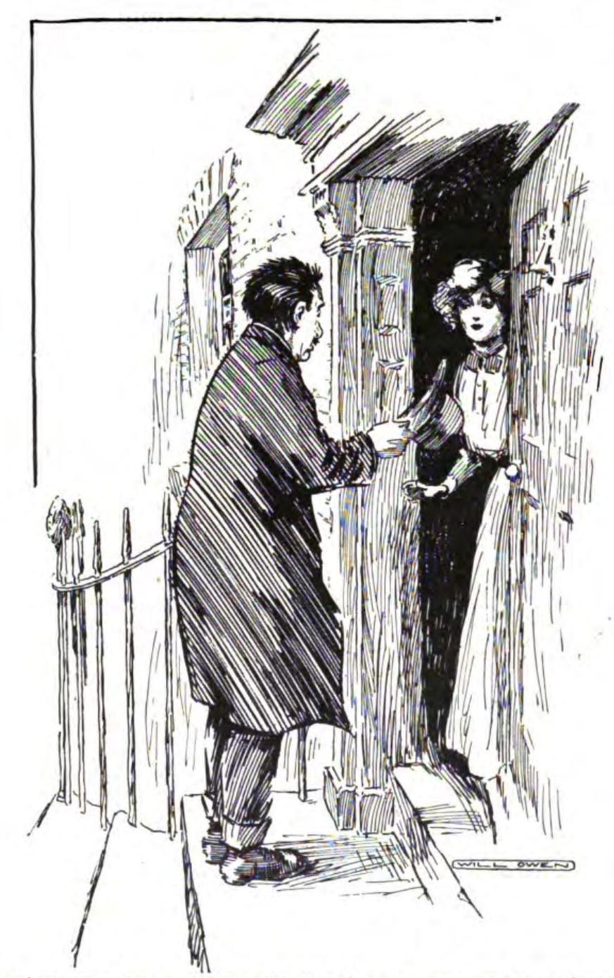
"" I CALLED, SAID MR. HATCHARD, CLEARING HIS THROAT-" I CALLED ABOUT THE BILL IN THE WINDOW."

"Just a matter o' business," continued her husband, "that's my way of looking at it--