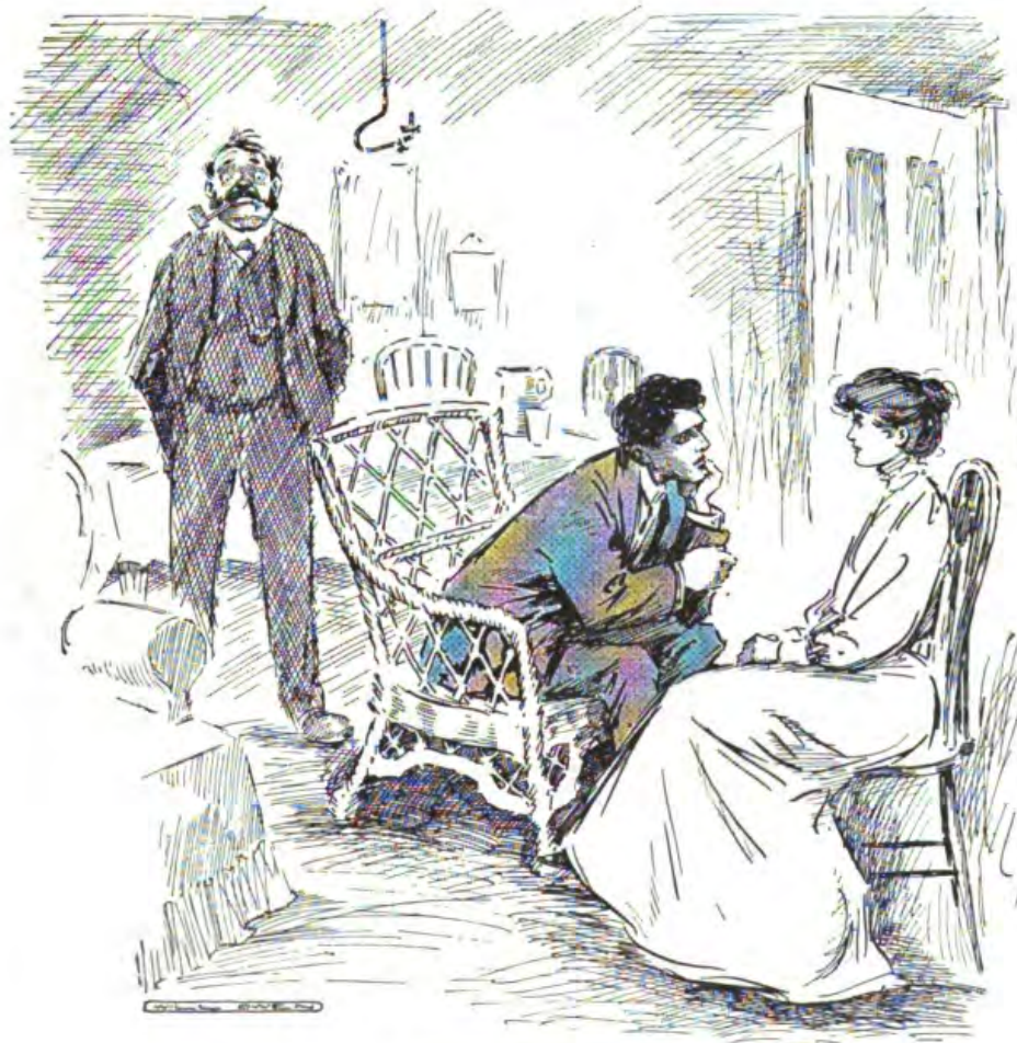
"CONSOLATIONS TO FLORA."

Mrs. Dowson gave him a singularly unkind look for one about to leave him so soon, and, afraid to trust herself to speech, left the room and went upstairs. As the door closed behind her, Mr. Foss took the chair which Mr. Lippet had thoughtlessly vacated, and offered such consolations to Flora as he considered suitable to the occasion.