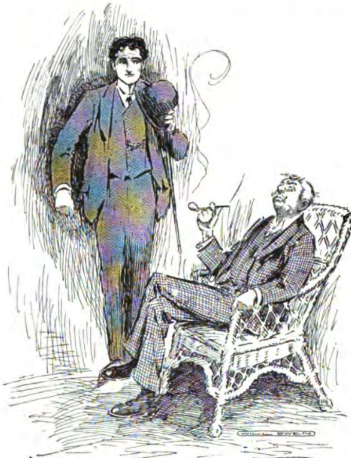
"MR. FOSS FOUND MR. LIPPET INSTALLED IN THE SEAT THAT USED TO BE HIS."

"I didn't want to tell you," she said, when