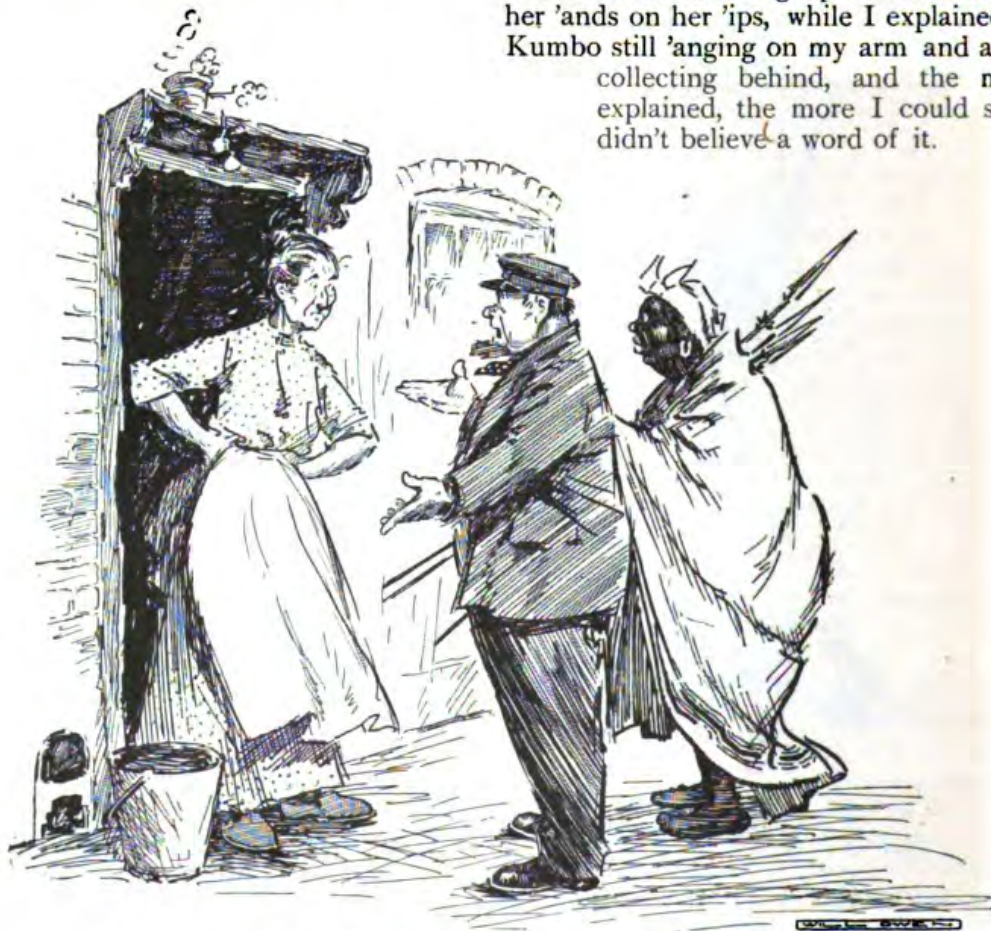
"SHE STOOD BLOCKING UP THE DOORWAY WITH HER 'ANDS ON 'ER 'IPS."

She stood blocking up the doorway with her 'ands on her 'ips, while I explained, with Kumbo still 'anging on my arm and a crowd collecting behind, and the more I explained, the more I could see she didn't believe a word of it.