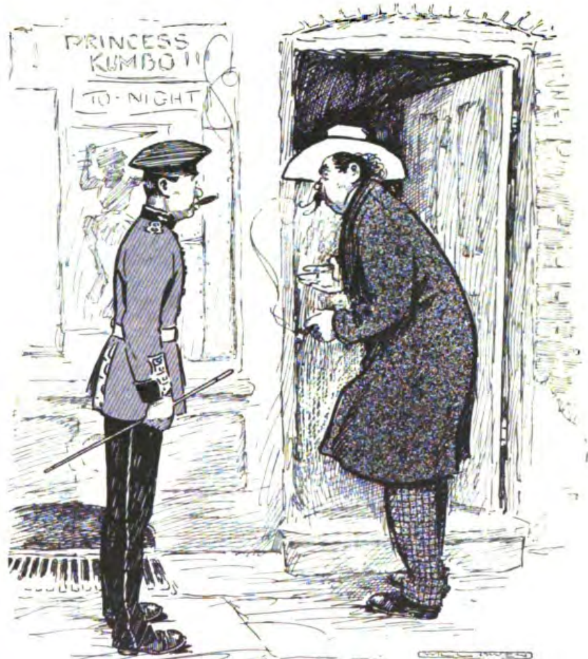
"TURNING ROUND AND GIVING RUPERT A NOD, HE OPENED THE DOOR WITH A KEY AND WENT INSIDE."

They went out separate, as the manager said it would be better for them not to be seen together, and Rupert, keeping about a dozen yards behind, follered 'im down the Mile End Road. By and by the manager