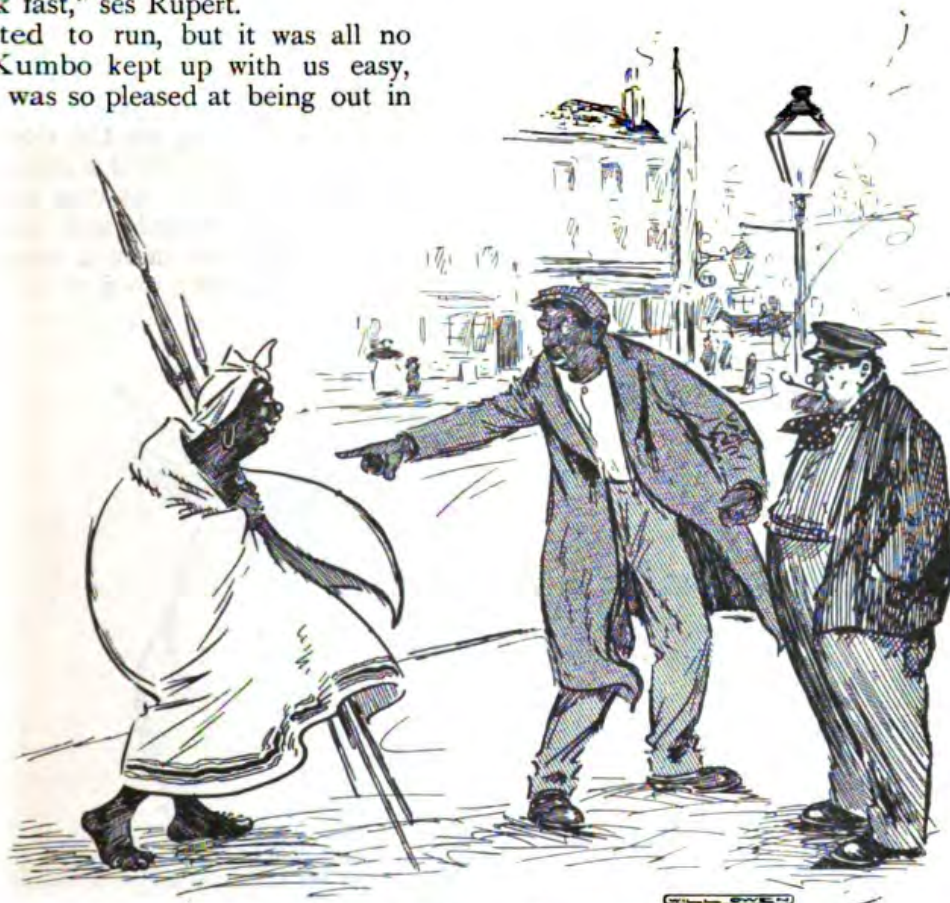
"'BACK!' SES RUPERT, IN A WHISPER, POINTING."

O' course, the crowd was round us agin, and to get rid of 'em I did a thing I'd seldom