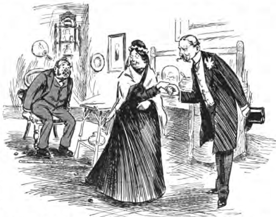
"HE TOOK HER EXTENDED HAND AND, BENDING OVER IT, KISSED IT RESPECTFULLY."

Mr. Clark attempted to relieve the situation by a jocose inquiry as to whether he was wearing a moustache at the time, but Mrs. Bowman frowned him down. He began to