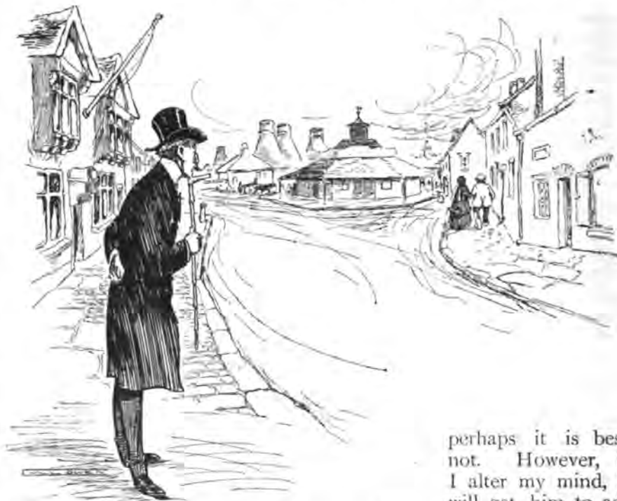
"MR. TUCKER STOOD WATCHING THEM FOR SOME TIME."

"Good-bye, Mr. Tucker," said the widow, holding out her hand. "Nathaniel did think of inviting you to come to my wedding, but