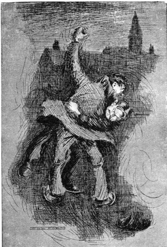
"IN THE TWINKLING OF AN EYE THEY HAD CLOSED."

He repeated his story at the station, and, after having his head dressed, was sent home and advised to keep himself quiet for a day or two. He was off duty for four days, and, the Tunwich Gazette having devoted a