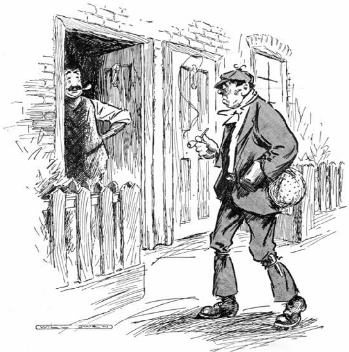
"I HEARD YOU LAST NIGHT," SAID THE CONSTABLE, PLAYFULLY.

He went in laughing and closed the door, and Mr. Grummit, after a frenzied outburst, proceeded on his way, returning the smiles of such acquaintances as he passed with an icy stare or a strongly-worded offer to make them laugh the other side of their face. The rest of the day he spent in working so hard that he had no time to reply to the anxious inquiries of his fellow-workmen.