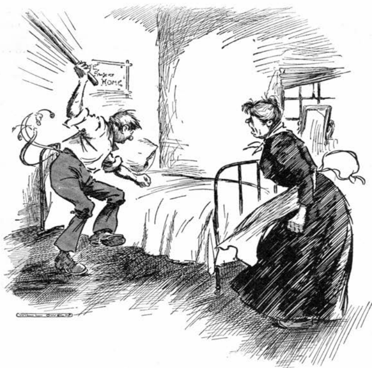
"MR. GRUMMIT, SUDDENLY REMEMBERING HIMSELF, STOPPED SHORT AND ATTACKED THE BED WITH EXTRAORDINARY FURY."

Mrs. Grummit in a husky voice explained.