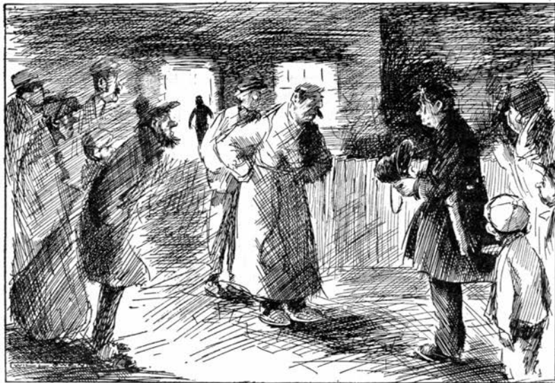
"HE TOOK OFF HIS BATTERED HELMET AND DISPLAYED A NASTY CUT ON HIS HEAD."

column to the affair, headed "A Gallant Constable," modestly secluded himself from the public gaze for the whole of that time.