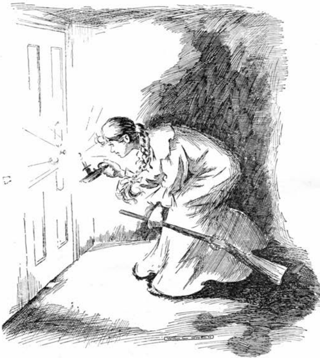
"HE RUSTLED THE PAPER UNDER THE DOOR."

"You ought to have done it before," commented the thoughtful Mr. Travers. "It's enough to give you your death of cold."