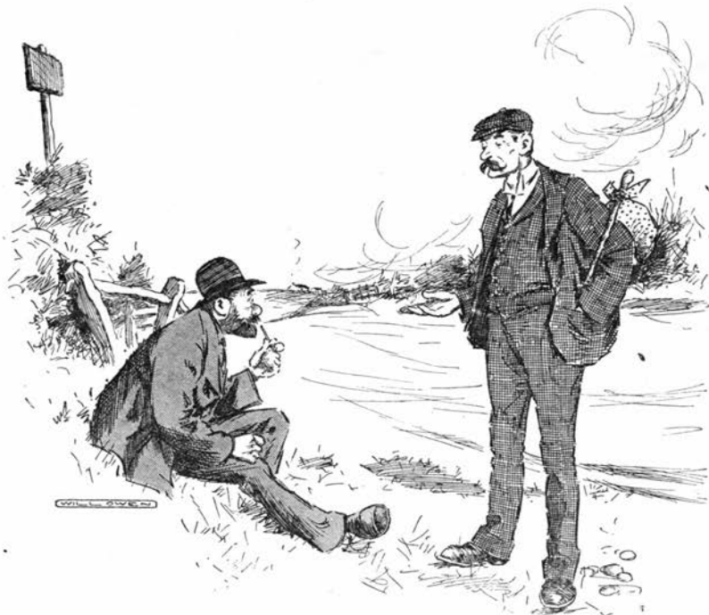
"I—I'LL MAKE IT TWO QUID," SAID THE BOATSWAIN."

"I—I'll make it two quid," said the boatswain, trembling with eagerness. "I've took