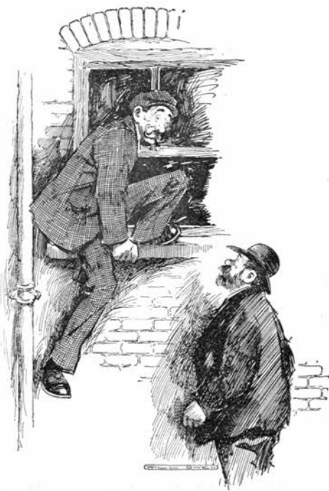
" GOOD-BYE, MATE," HE SAID, HOISTING HIMSELF ON TO THE SILL. "