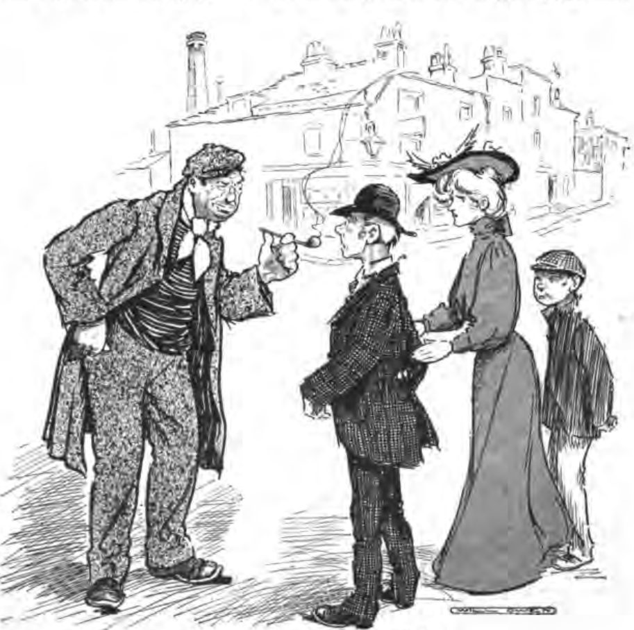
"GEORGE, MAKE 'IM BEG MY PARDON."

They 'ad their guesses, and then they went in and asked, and as soon as Gerty found that it was only three-and-sixpence she began to feel in her pocket for 'er purse, just like