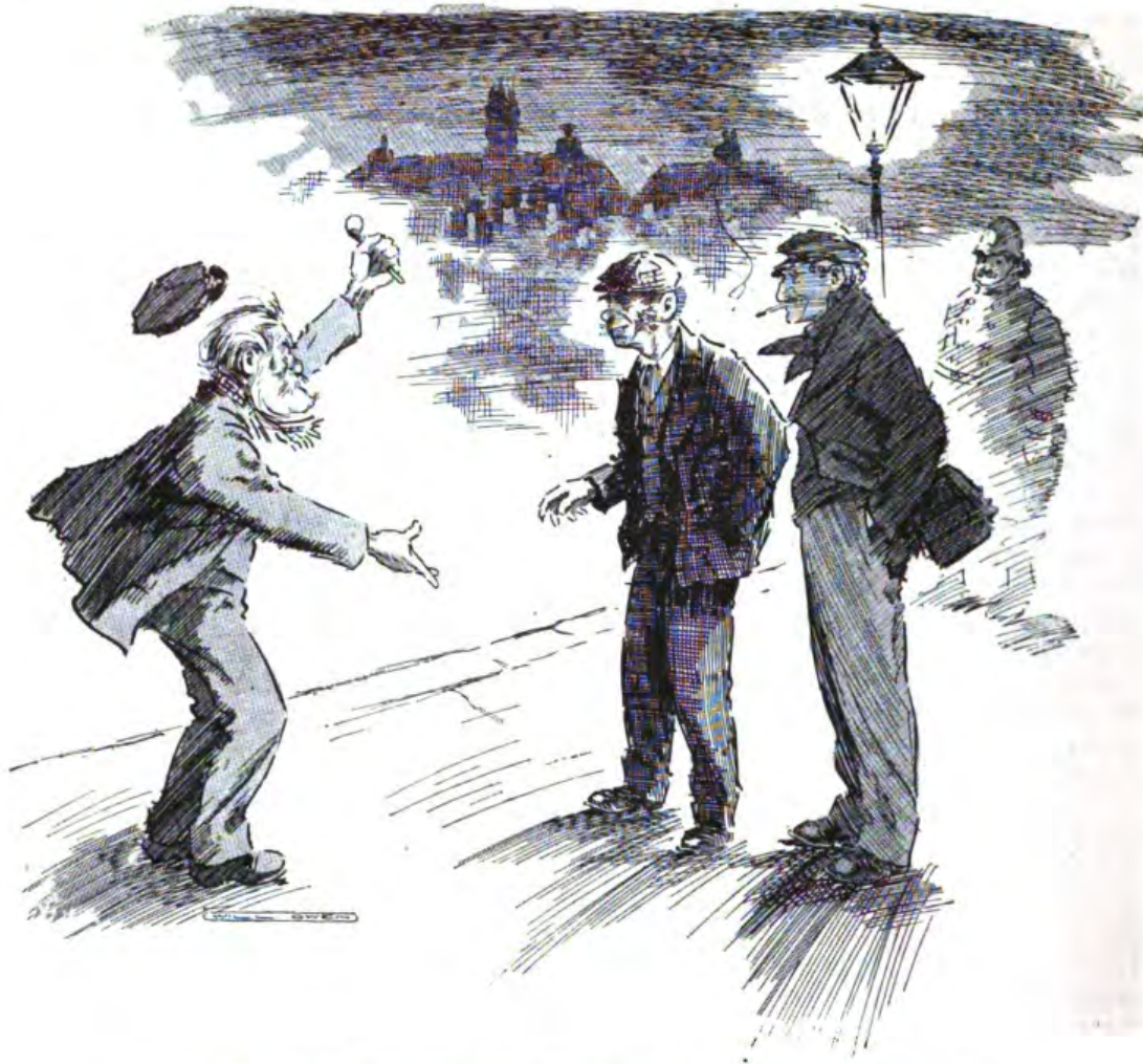
"HE BROKE OUT SO ALARMING THAT THEY COULD 'ARDLY DO ANYTHING WITH 'IM."

Russet wanted some tobacco ; and old Sam Small walked in smiling, with a little silver brooch for 'er, that he said e' had picked up.