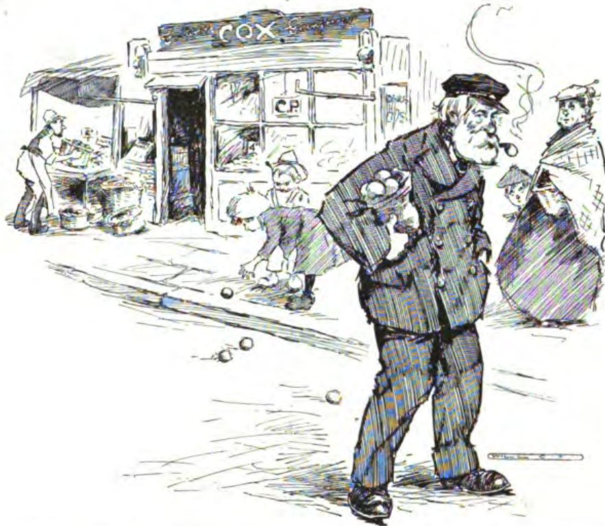
"OLD SAM CREPT BACK 'OME LIKE A MAN IN A DREAM, WITH A BAG OF ORANGES HE DIDN'T WANT."

Old Sam crept back 'ome like a man in a dream, with a bag of oranges he didn't want, and, arter making a present of the engagement-ring to Ginger—if 'e could get it—he took the fust train to Tilbury and signed on for a v'y'ge to China.