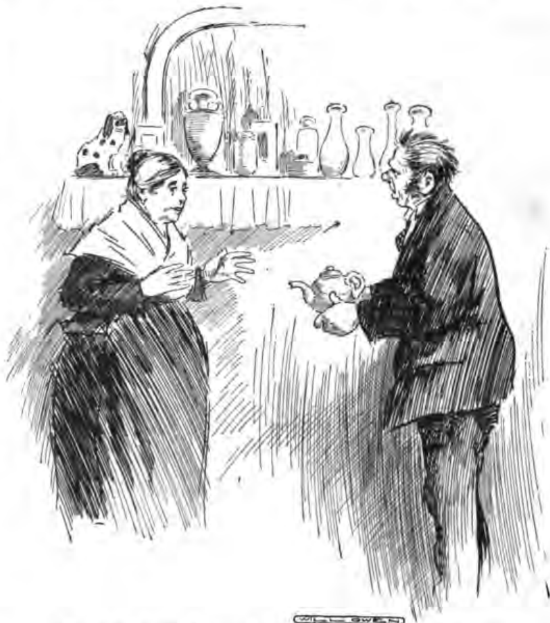
"HE TOOK 'ER A LITTLE CHINEY TEAPOT HE 'AD PICKED UP DIRT CHEAP,"

With three men all courting 'er at the same