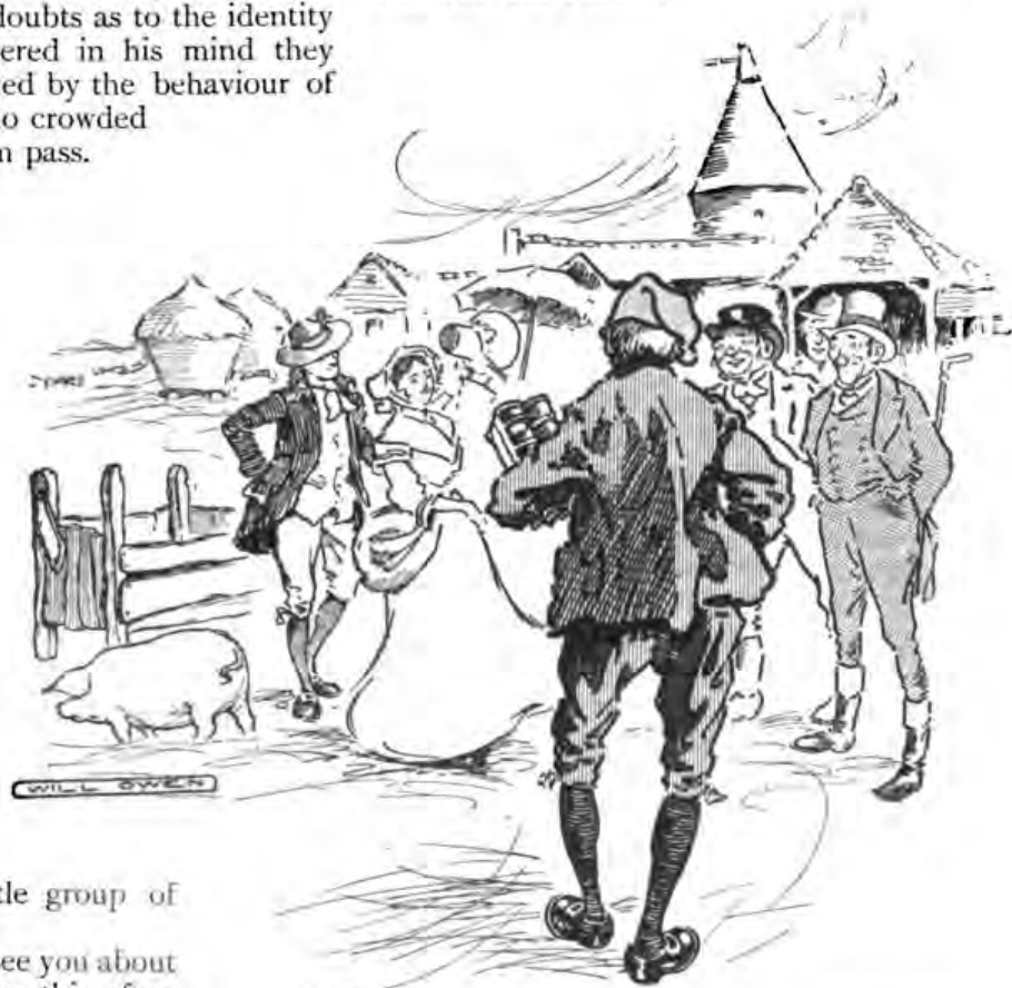
"COME DOWN TO HAVE A LOOK AT THE PRISONER?" INQUIRED THE FARMER.

"Well, if I was you," said Mr. Quince, concealing his satisfaction with difficulty, "I should let him out at once and beg his pardon, and say you hope he'll do nothing about it. I'll put in a word for you if you like with old Pascoe."