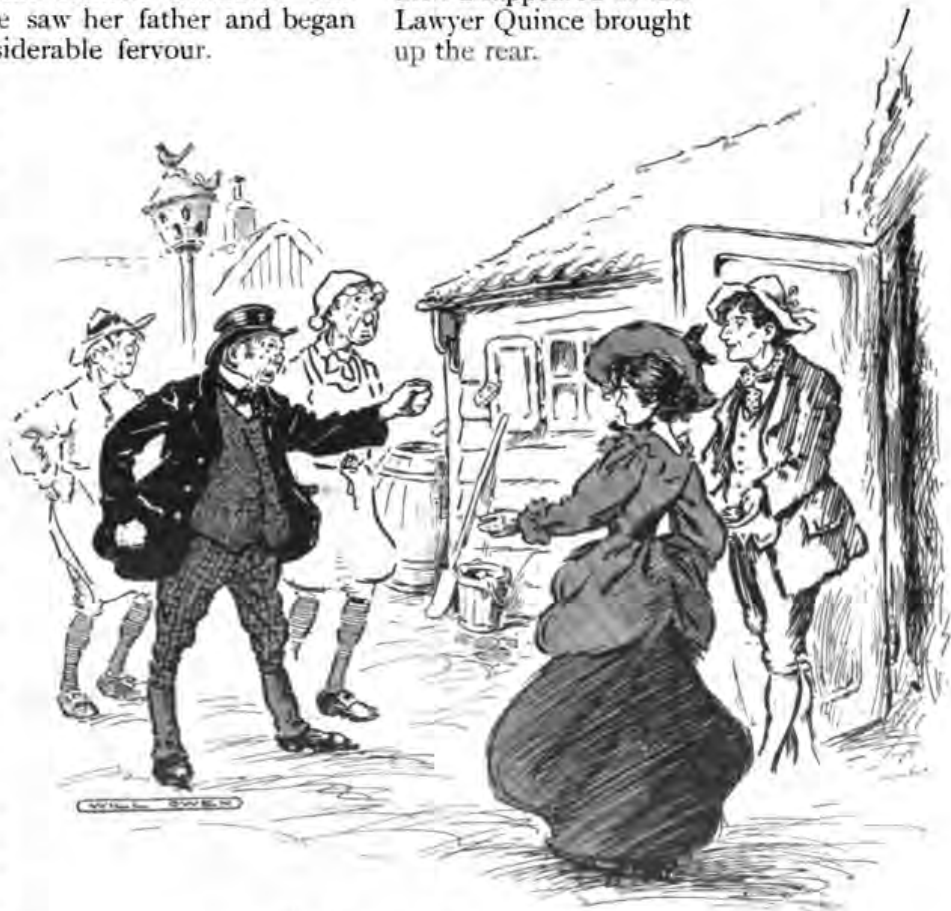
"'HOW DID YOU GET IN THAT SHED?' DEMANDED HER PARENT."