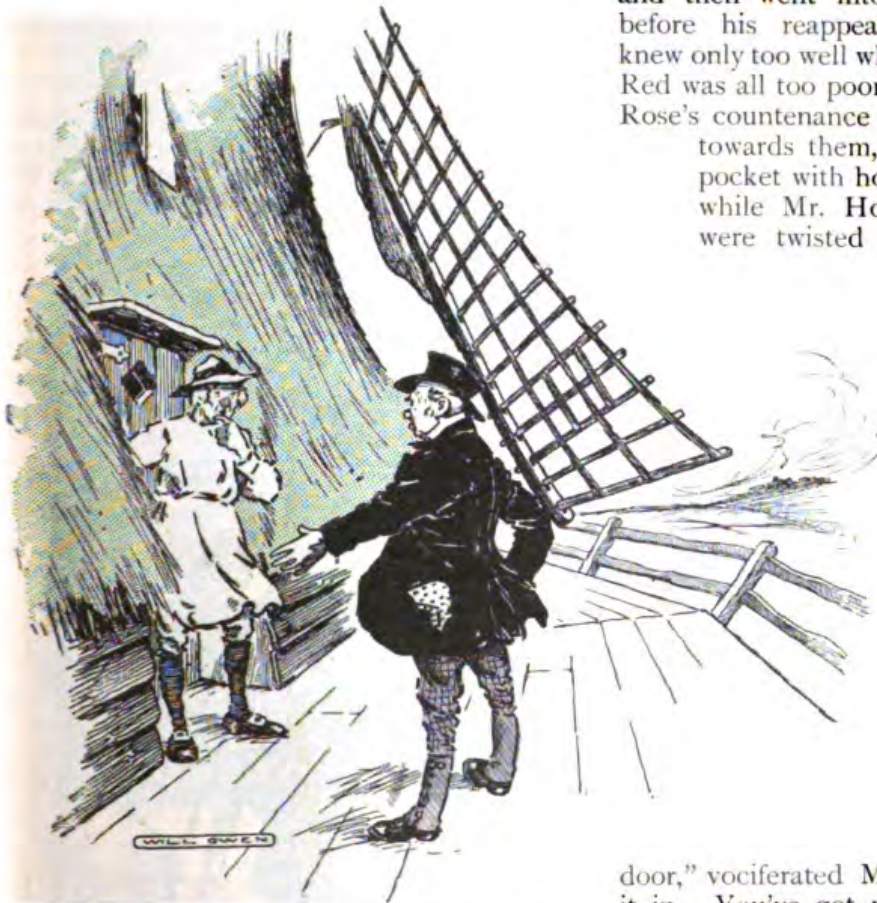
"I THOUGHT ALL ALONG AS HOW LAWYER QUINCE WOULD HAVE THE LAUGH OF YOU."

"Don't trespass on my premises," said Lawyer Quince, interposing his long, gaunt frame. "If you want that door opened you'll have to wait till my boy Ned comes home. I expect he knows where to find the key."