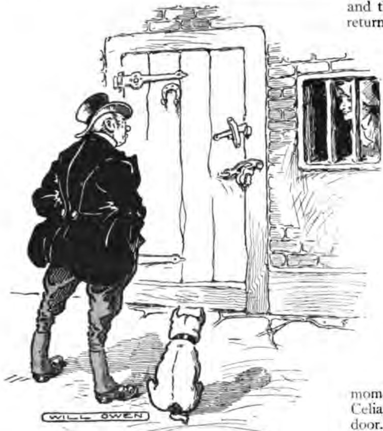
"'NONE O' YOUR IMPUDENCE,' SAID THE FARMER."

to his trade it would be better for himself and everybody else.