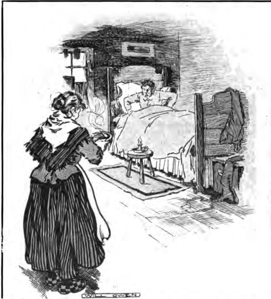
"THE WAY HE CARRIED ON WHEN THE LANDLADY FRIED THE STEAK SHOWED 'OW UPSET HE WAS."

"Webson and Julia Tucker was married at eleven o'clock yesterday morning," ses Bill Lumm, in a hoarse voice. "When I