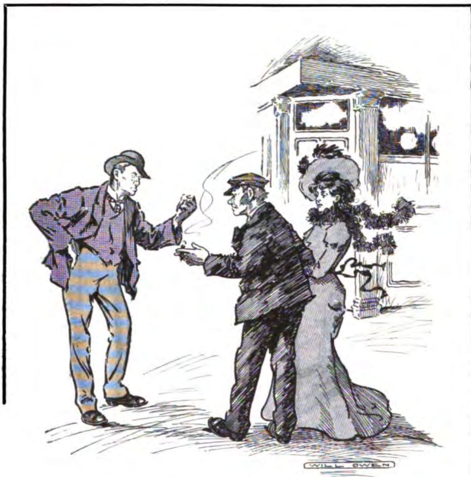
"LET GO O' THAT YOUNG LADY'S ARM, HE SES.

"Let go o' that young lady's arm," he ses.