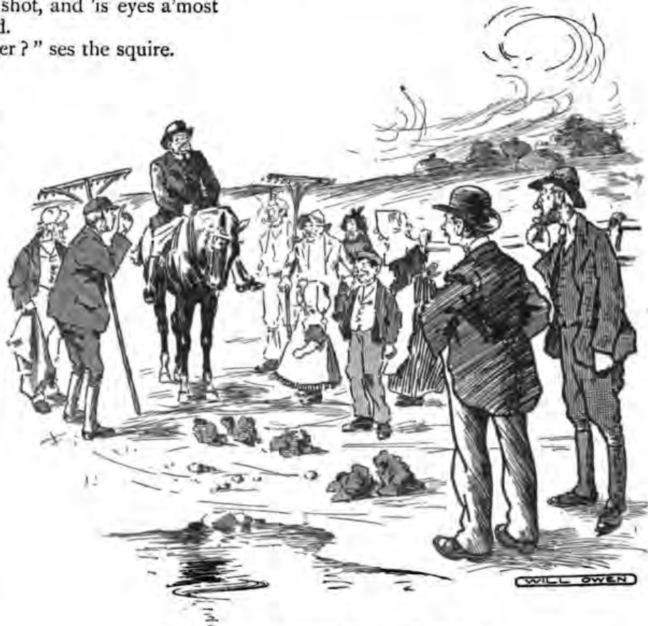
"'YOU OUGHT TO BE MORE CAREFUL,' SES BOB."

"Come along, old gal," 'e ses. "I want my breakfast bad, and arter that I shall 'ave to lose a honest day's work in bed."