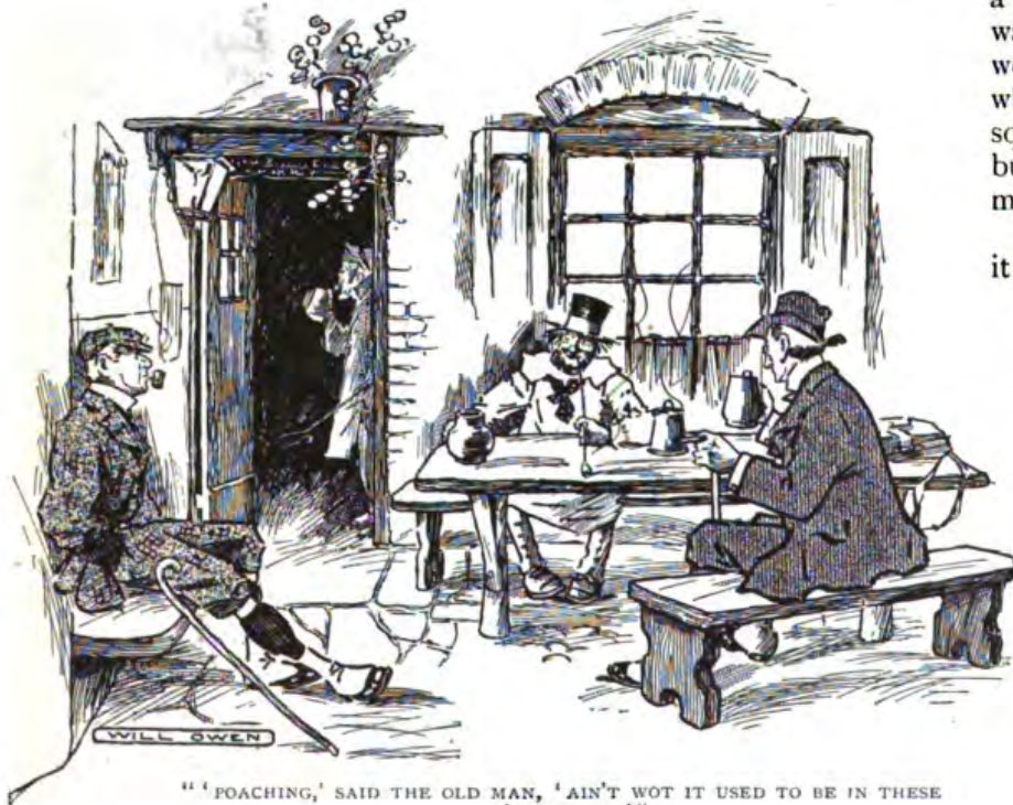
"'POACHING,' SAID THE OLD MAN, 'AIN'T WOT IT USED TO BE IN THESE 'ERE PARTS.'"

HE old man sat on his accustomed bench outside the Cauliflower. A generous measure of beer stood in a blue and white jug by his elbow, and little wisps of smoke curled slowly upwards from the bowl of his churchwarden pipe. The knapsacks of two young men lay where they were flung on the table, and the owners, taking a noon-tide rest, turned a polite, if bored, ear to the reminiscences of grateful old age.