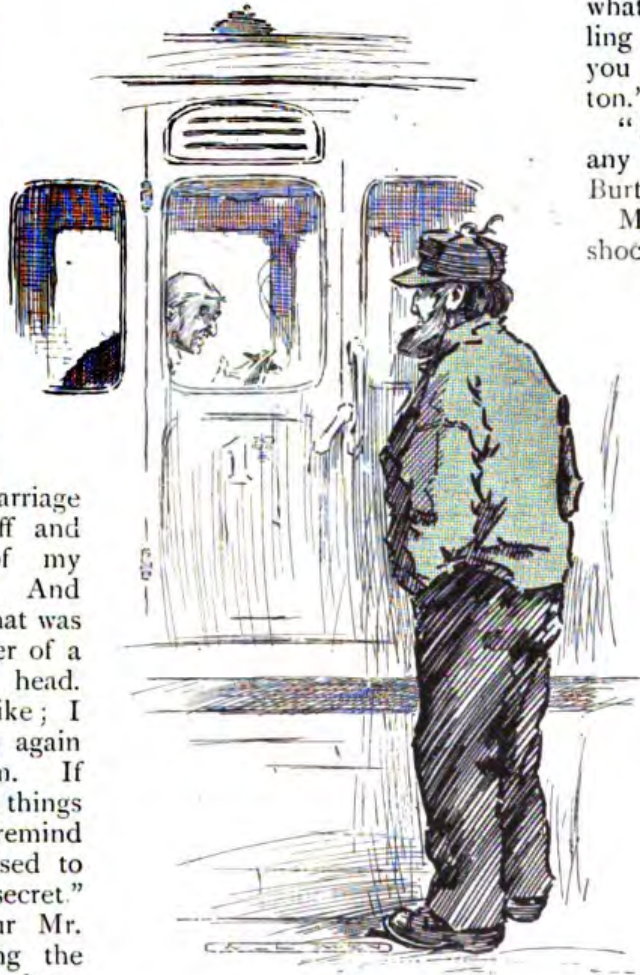
"'GOOD RIDDANCE,' SAID MR. BURTON, SAVAGELY."

"My wife," said Mr. Stiles, as a huge smile spread slowly over his face. "Good-bye, George, and don't forget to give my love when you go round."