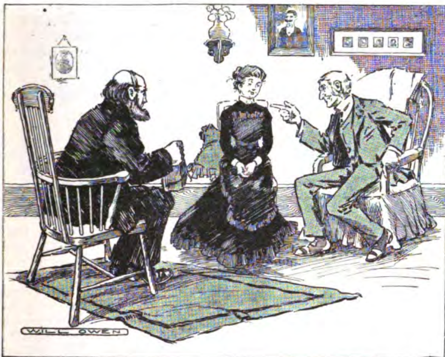
"MR. STILES CALLED THE WIDOW A 'SAUCY LITTLE BAGGAGE.'"

Mr. Burton, suppressing his choler, affected to ponder. "If arf a sovereign——" he said, at last.