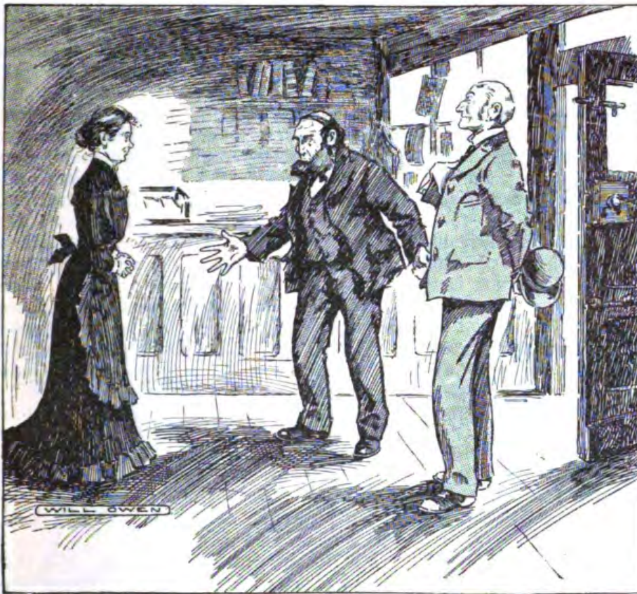
"MR. STILES WAS AFFECTING A STATELINESS OF MANNER WHICH WAS NOT WITHOUT DISTINCTION."

Mr. Burton favoured him with a mutinous scowl.