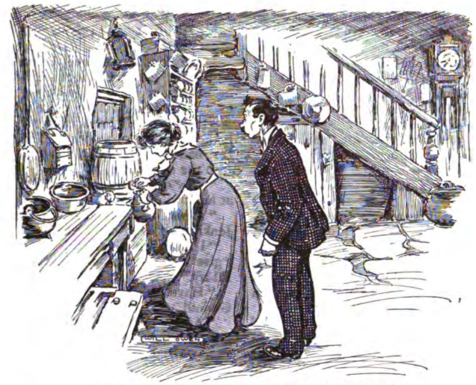
"MR. SIMS WATCHED HER TENDERLY AS SHE DREW THE BEER."

living-room, and the plates on the dresser were nearly shaken off their shelves.