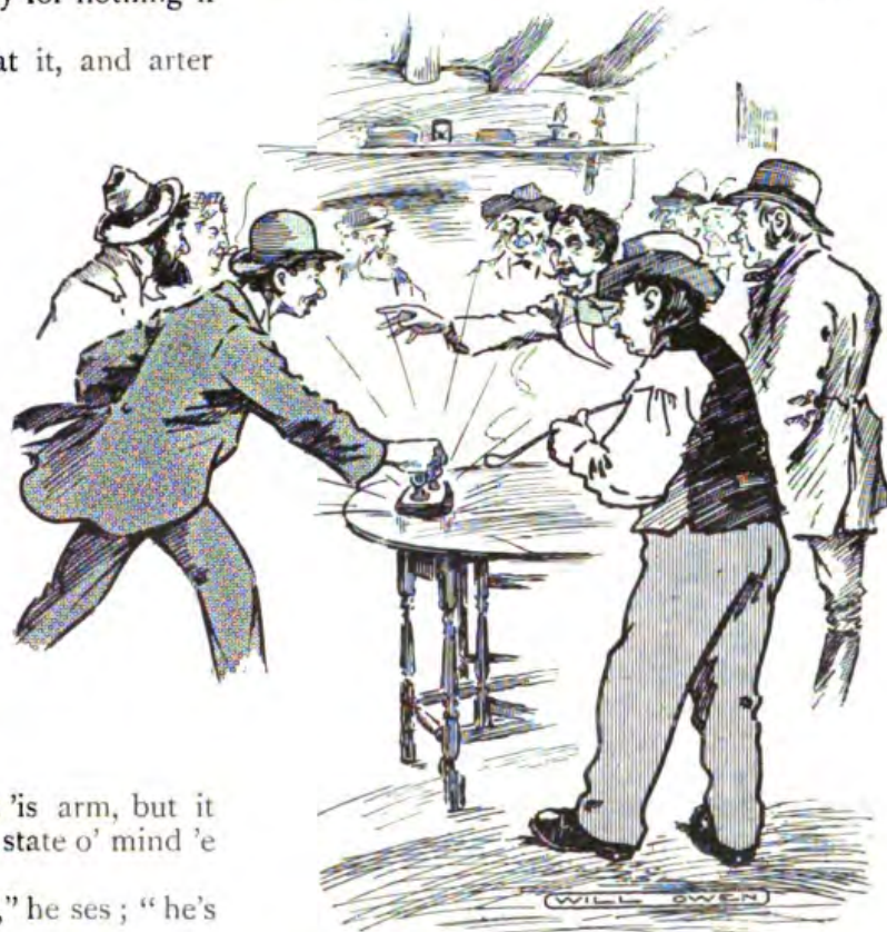
"AFORE ANYBODY COULD MOVE, HE BROUGHT IT DOWN BANG ON THE FACE O' THE WATCH."

"George Kettle shall load the pistol and fire it if 'e won't," ses Bob Pretty. "'Aving