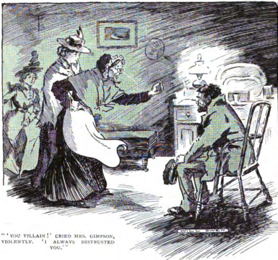
"'YOU VILLAIN!' CRIED MRS. GIMPSON, VIOLENTLY. 'I ALWAYS DISTRUSTED YOU.'"

"That's right," he said, cheerfully. "So long as you believe in me I don't care what other people think. And before I'm much older I'll find out how that old rascal got to know the names of the ships I was aboard. Seems to me somebody's been talking."