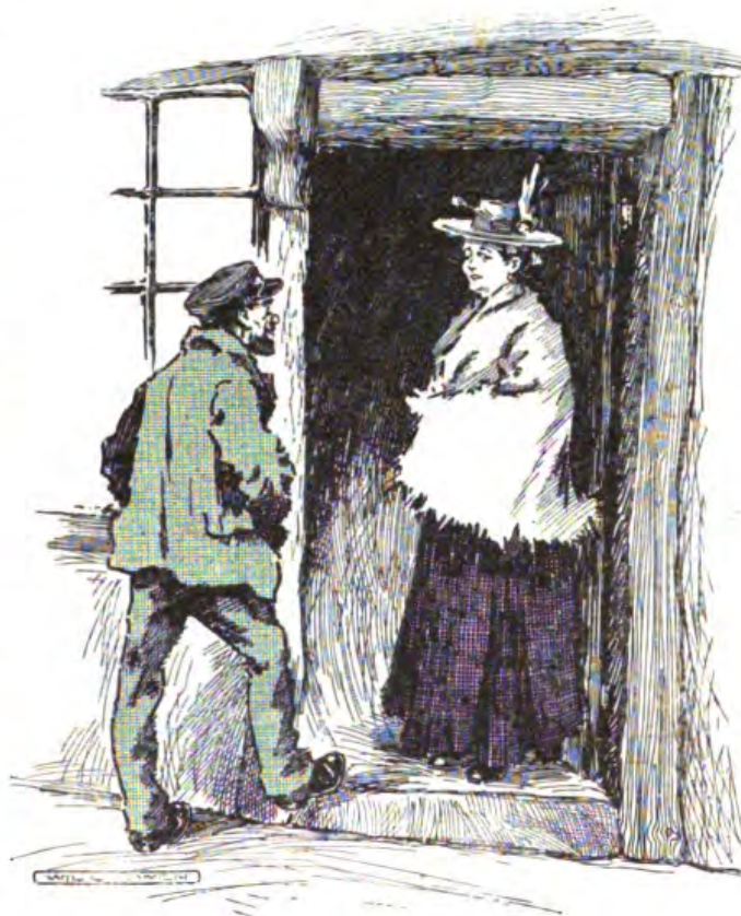
Mr. Boxer "HAVE YOU LEFT ANYTHING INSIDE THAT YOU WANT?" SHE INQUIRED.

"I married her," said Mr. Boxer, considering—"I married her at Camberwell, in eighteen ninety-three."