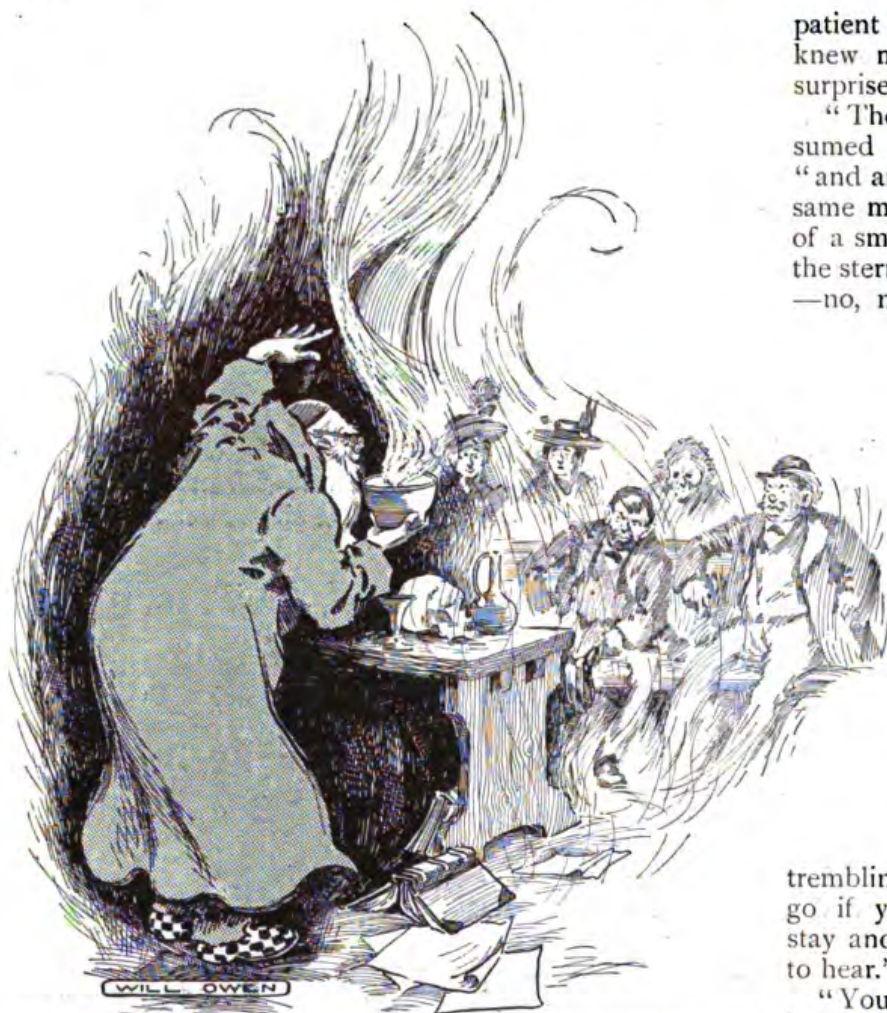
"AH! WHAT IS THIS? A PIECE OF WRECKAGE WITH A MONKEY CLINGING TO IT?"

pretty but dusky maiden approaches the castaway. She assists him into the canoe and his head sinks on her lap, as with vigorous strokes of her paddle she propels the canoe towards a small island fringed with palm trees."