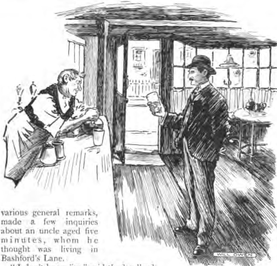
"MR. CATESBY MADE A FEW INQUIRIES."

Mr. Catesby looked from one to the other in consternation.