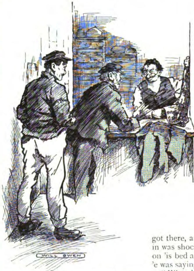
"THEY PUT OLD ISAAC'S CLOTHES UP FOR FIFTEEN SHILLINGS."

It was a long time afore Peter could understand wot 'e meant, but as soon as 'e did 'e started to look for 'em. Drink takes people in different ways, and the way it always took