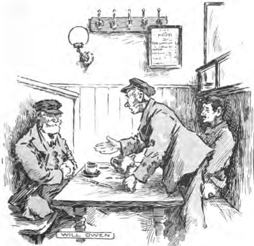
"'WOT'S THIS FOR?' SES GINGER."

and see your mother, Peter," ses the old man.