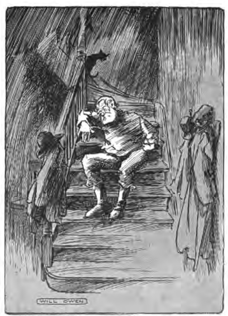
"'E PICKED OUT THE SOFTEST STAIR HE COULD FIND."

It was about six o'clock when 'e woke up, and broad daylight. He was stiff and sore all over, and feeling braver in the light 'e stepped softly upstairs and opened the door. Peter and Ginger was waiting for 'im, and as he peeped in 'e saw two things sitting up in