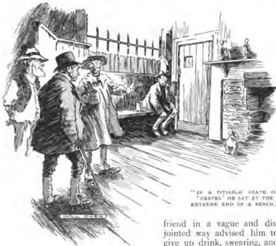
"'IS A PITIABLE STATE OF 'SERVES' HE SAT AT THE EXTREME END OF A BENCH."

Mr. Carter called for some more beer and told the barmaid to put a little gin in it. In a pitiable state of "nerves" he sat at the extreme end of a bench, and felt that he was an object of unwholesome interest to his acquaintances. The finishing touch was put to his discomfiture when a well-meaning