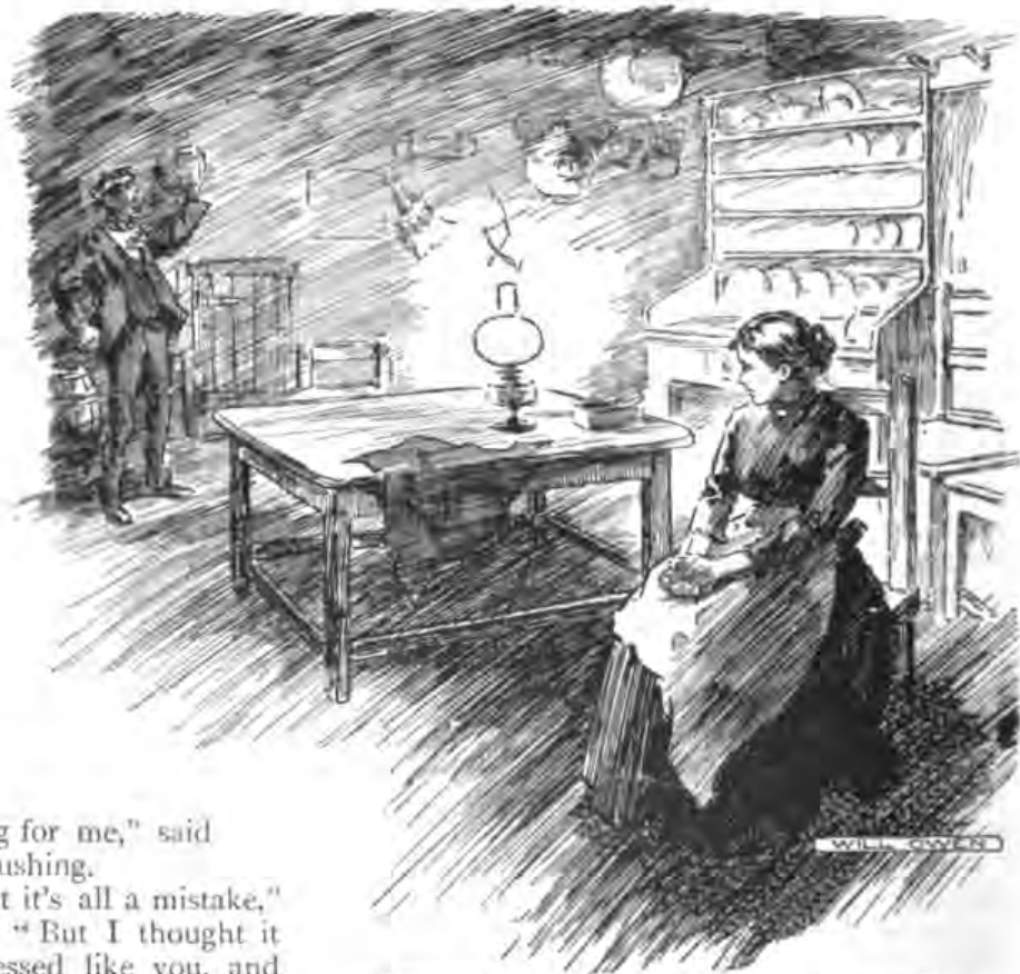
"THEY DRAGGED THE RIVER," RESUMED HIS WIFE, "AND FOUND THE CAP."

"The rector preached the sermon," continued his wife; "a beautiful sermon it was, too. I wish you'd been there to hear it; I