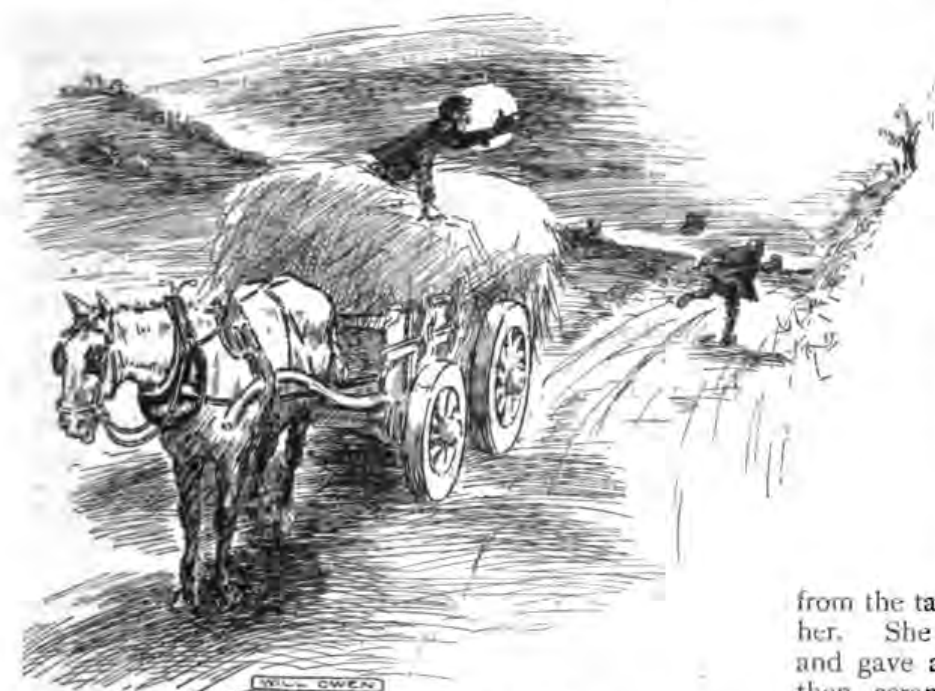
“‘JOE!’ SHOUTED MR. BLOWS, ‘J-O-O-OE!’”

horse, undisturbed by the driver's absence, placidly continued its journey. A mile farther, however, he got down to take the short cut by the fields.