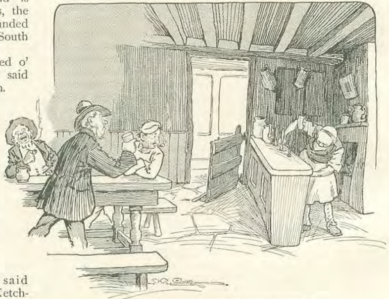
"THE LANDLORD AFFECTED NOT TO HEAR."

"Killed the whole seventeen of 'em by first telling 'em yarns till they fell asleep and