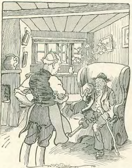
"HE WIPED HIS EYES TO THE MEMORY OF THE FAITHFUL BLACK."

He fumbled in his pocket, and producing the remains of a dirty handkerchief wiped his eyes to the memory of the faithful black.