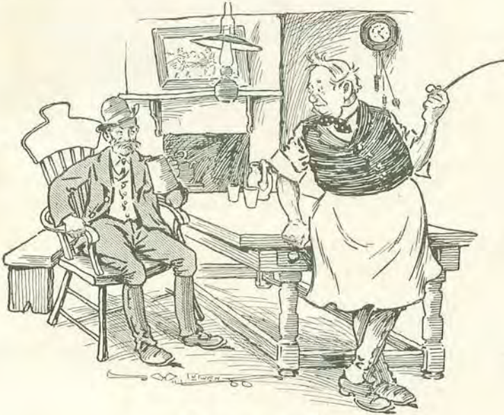
"BREAKING THE NEWS."

"Ketchmaid told me hisself as he'd paid your passage to New Zealand," said the shoemaker; "he said as 'e'd pressed you to stay, but that you said as blood was thicker even than friendship."