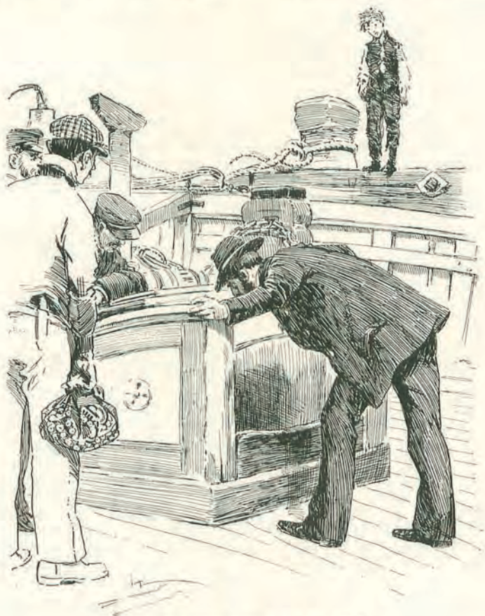
"YOU'D BETTER COME UP AND SEE HIM."

"I wouldn't do it for everybody," pursued