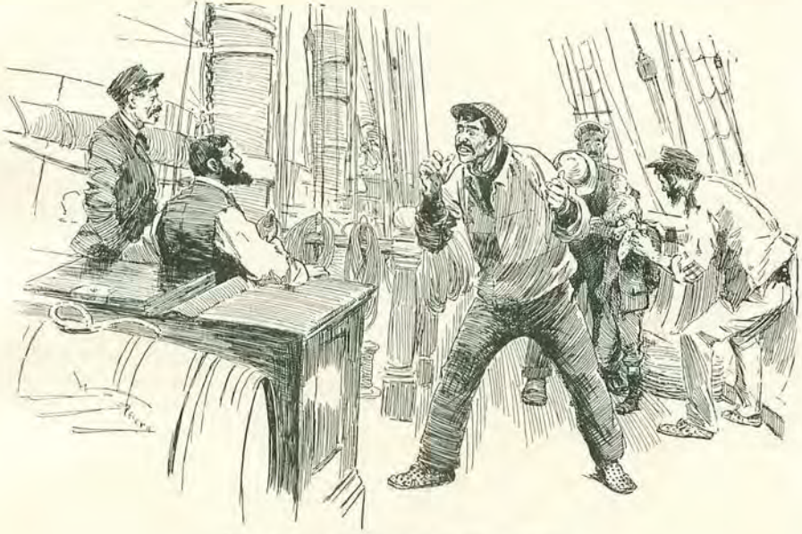
“‘DON'T TALK NONSENSE,’ SAID THE SKIPPER.”

He took the wheel from Harry; the little town came closer; the houses separated and disclosed roads, and the boy discovered to his disappointment that the church stood on ground of its own, and not on the roof of a