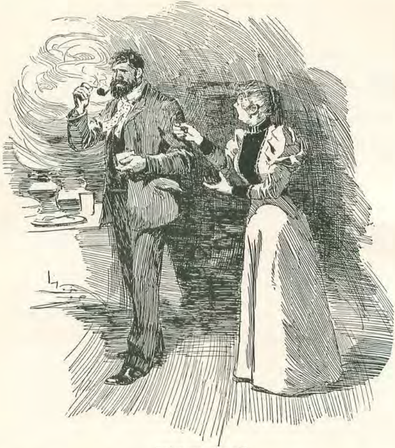
"WHAT DID YOU SAY?"

and laughed silently, until his wife, coming behind him, took him by the shoulders and shook him violently.