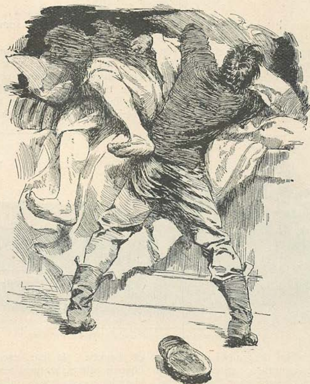
"HE STROVE TO LIFT HIM OUT OF THE BUNK."

The cook placed his burden upon its feet, and running up the ladder stood by the mate shivering. The latter struck another match, and the twain watched in breathless silence