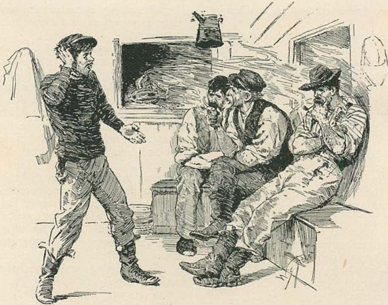
“‘HE’S GONE MAD,’ SAID HE, SLOWLY.”

all together—I certainly thought he was poisoned.”