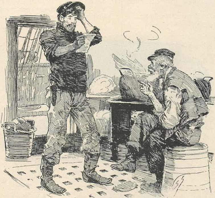
"AS HE READ THE LETTERS DANCED BEFORE HIM."

For about six months the cook, although always in somewhat straitened circumstances, was well content with the tacit bargain, and then, bit by bit, the character of Mr. Lister was revealed to him. It was not a nice