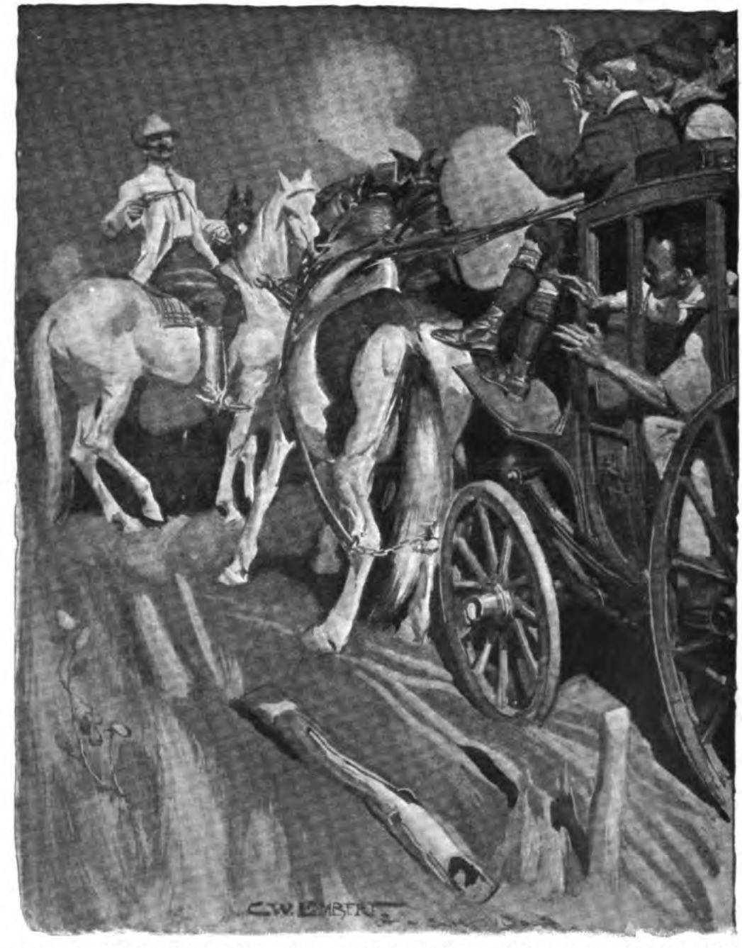
"MR. KENTISH WATCHED THE LITTLE OPERATION OF 'STICKING UP' WITHOUT A WORD."