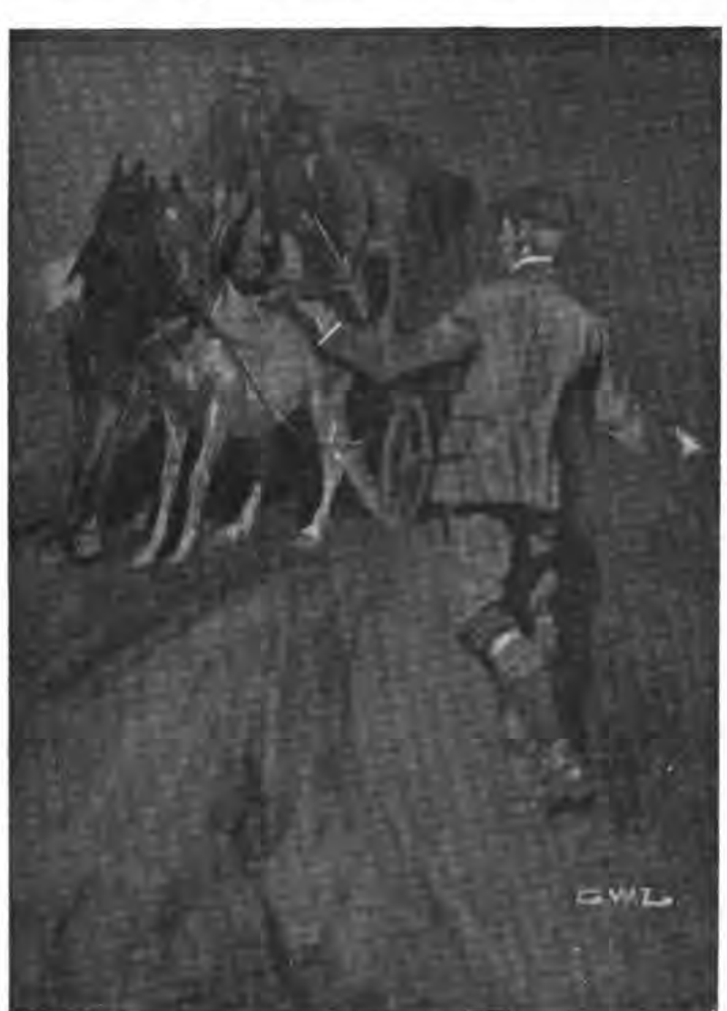
" DON'T SHOOT!" HE CRIED."

passenger you put down this afternoon." And the driver nearly tumbled from his perch.