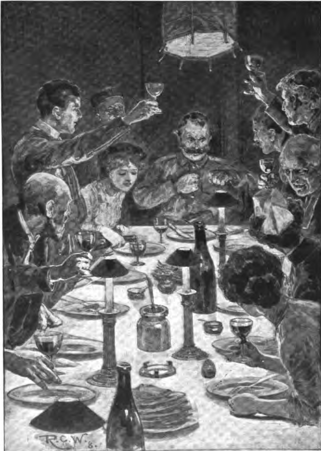
"I ASK YOU TO DRINK THE HEALTH OF COLONEL DRESLER, OF THE IMPERIAL GERMAN ARMY."

of the Imperial German army. Er soll leben—hoch!"