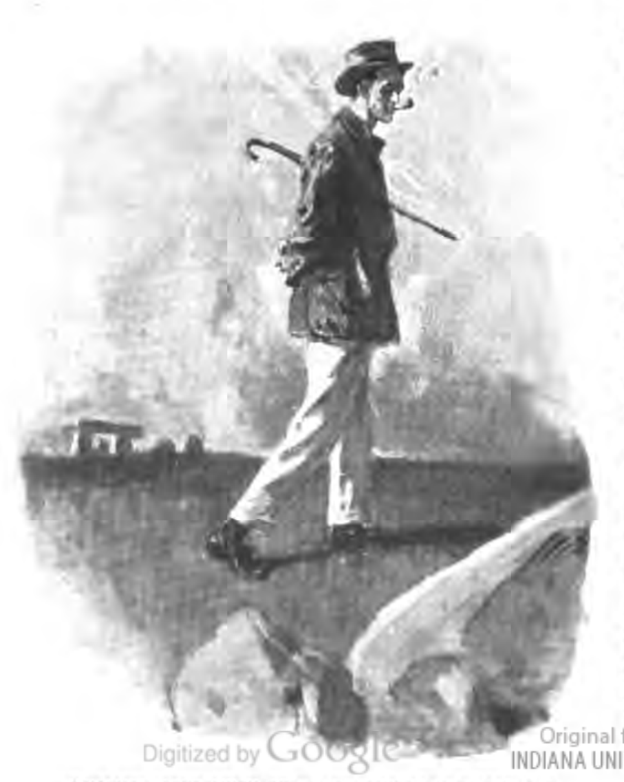
"HOLMES SPENT MUCH OF HIS TIME IN LONG WALKS AND SOLITARY MEDITATIONS."