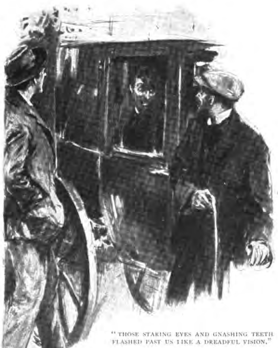
turned our steps towards this ill-omened

We looked with horror after the black carriage, lumbering upon its way. Then we